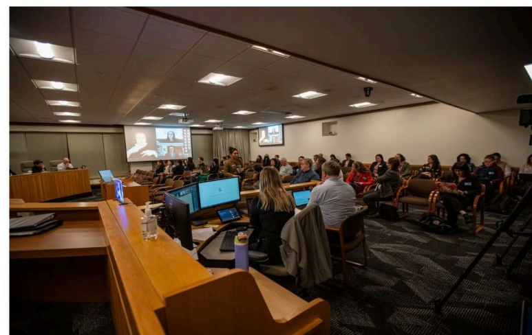
The Joint Committee on Addiction and Community Safety Response holds a public hearing on Measure 110 in Salem on Feb. 8. A proposal that would recriminalize drug possession and call for counties to set up "deflection" programs to steer drug users to treatment would mark an important step in addressing the addiction crisis, the editorial board writes.

Updated: Feb. 25, 2024, 6:46 a.m. | Published: Feb. 25, 2024, 6:45 a.m.