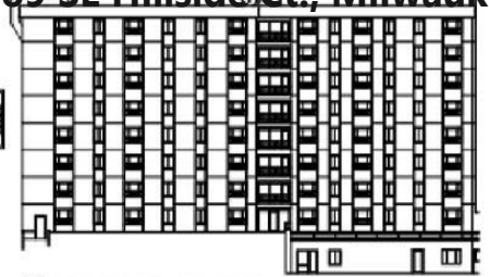
SOUTH SIDE ELEVATION (FRONT) SCALE: YES