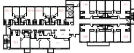
SECOND LEVEL - FLOOR PLAN SCALE: YES