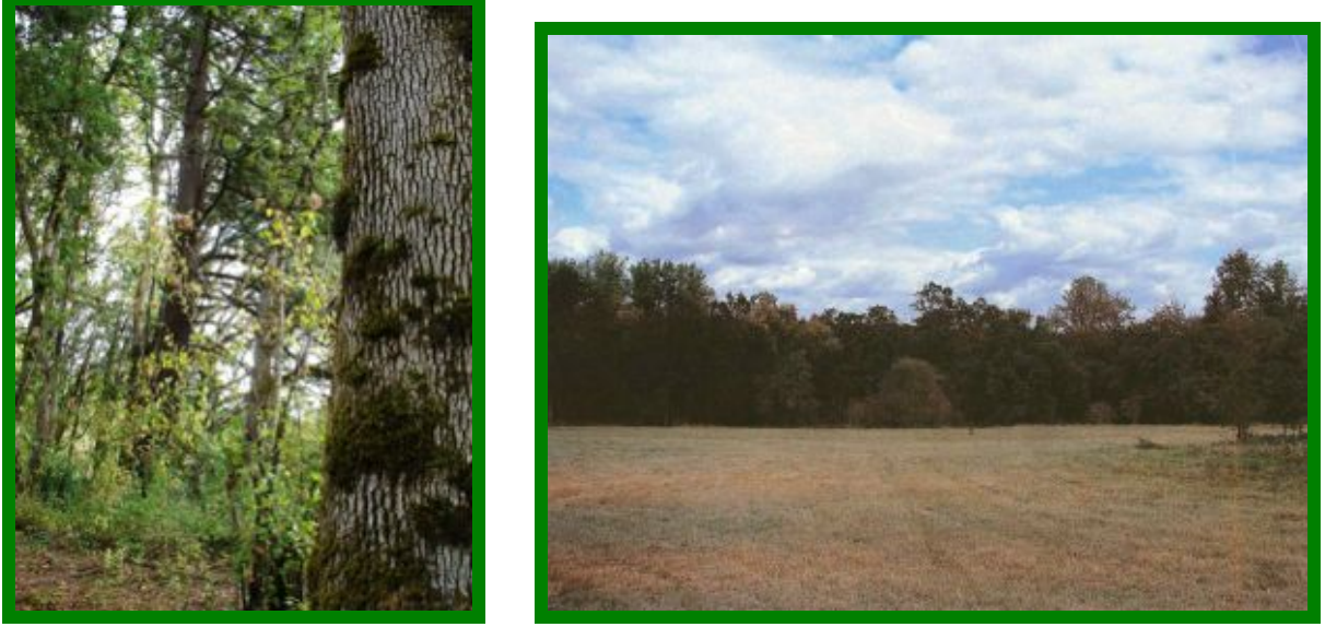
Groves of maples, oaks & ash from a distance - Foxglove Farm