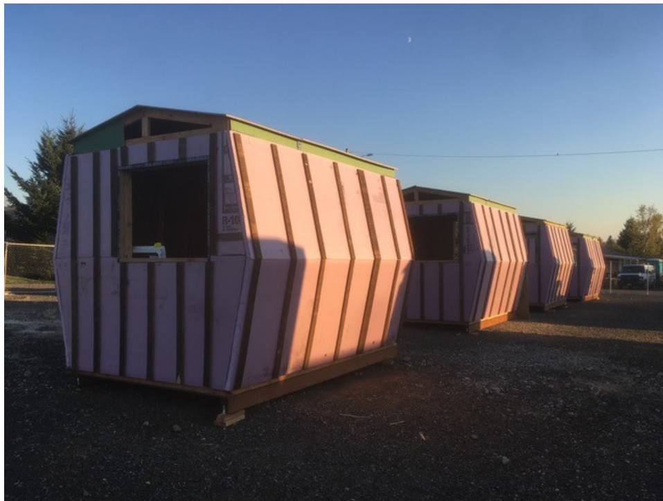
You can see the insulation of sleeping pods, before the siding was put on.