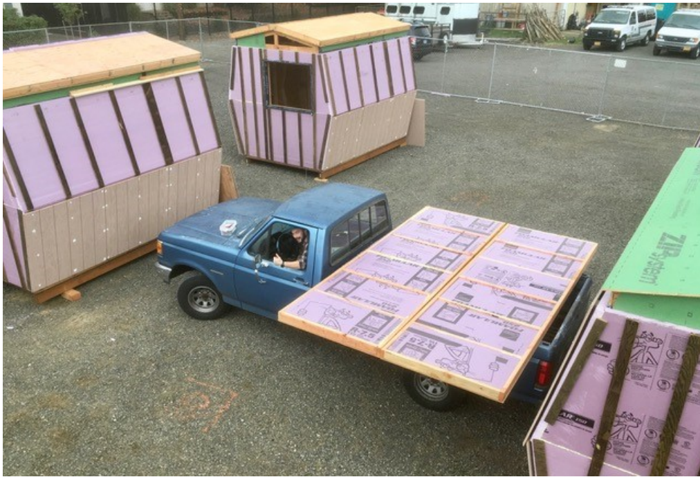
Kirk of City Repair driving the “Lift Truck” in an impossibly tight corridor.

The photos below show general incremental progress, as well as our lifting crew and their “topping out” party.