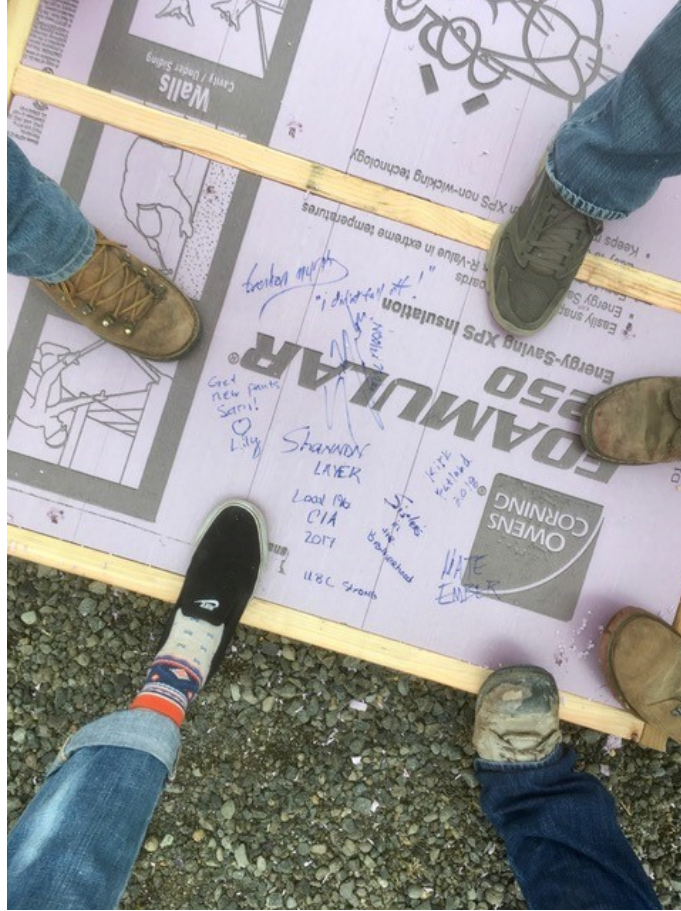
The last roof diaphragm, signed by the lifting crew.