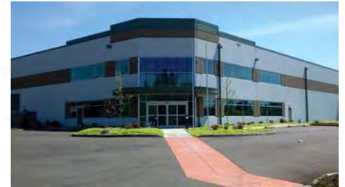
Anderson Quality Spring