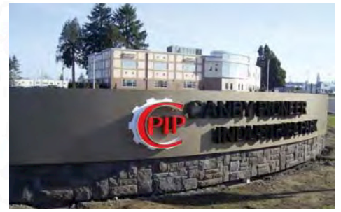
Canby's Pioneer Industrial Park