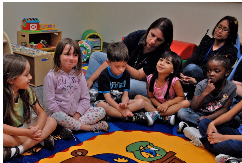
Community space for programs and enrichment