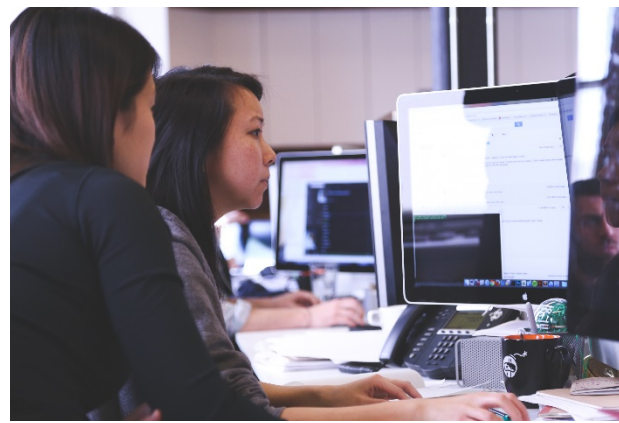
A place to research