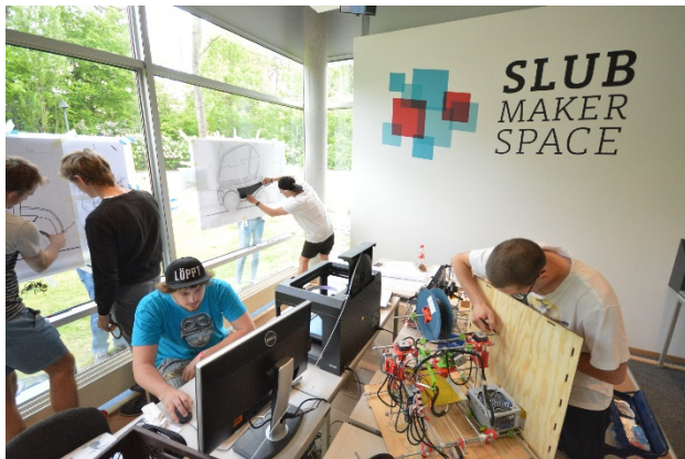
A place to create and design