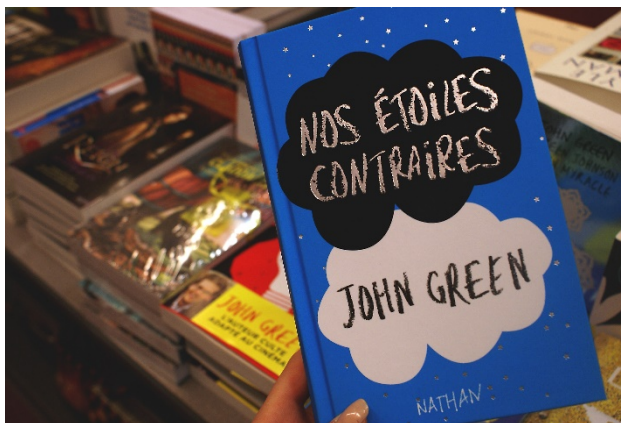
A place for other languages