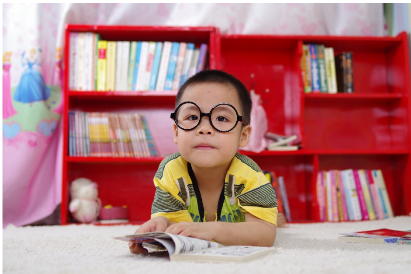
A place where kids can develop a love of reading