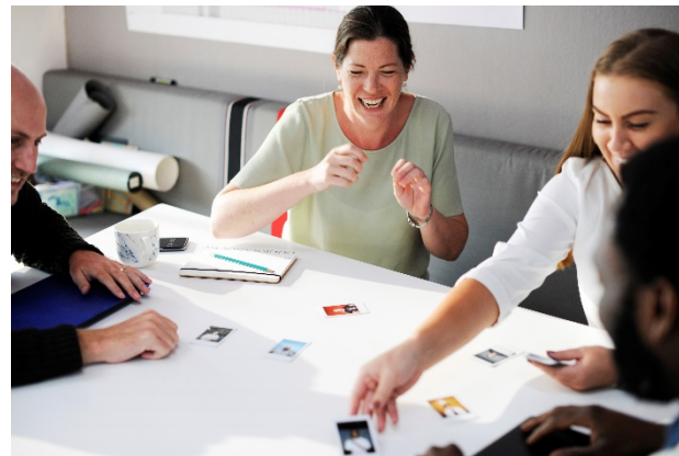
A place to meet