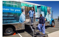
Mobile Health Services

PARK PLACE REDEVELOPMENT | CLACKAMAS HOUSING AUTHORITY MARCH 8, 2024