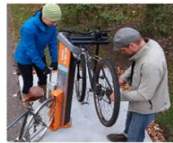
Bike Storage / Maintenance