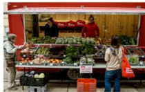
Mobile Farmers Markets