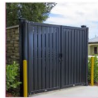
Secure Waste Enclosure

Which of these are the most important or exciting to you?