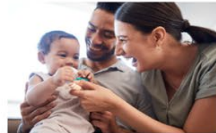
New Parent Resources