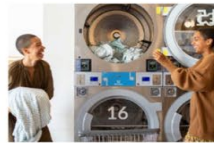
Laundry / Lounge