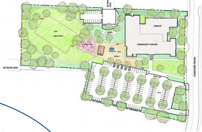
Library located within Concord building