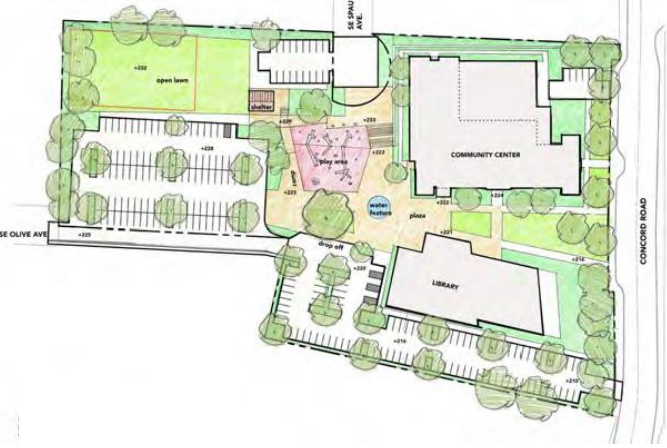
Separate library across from Concord building