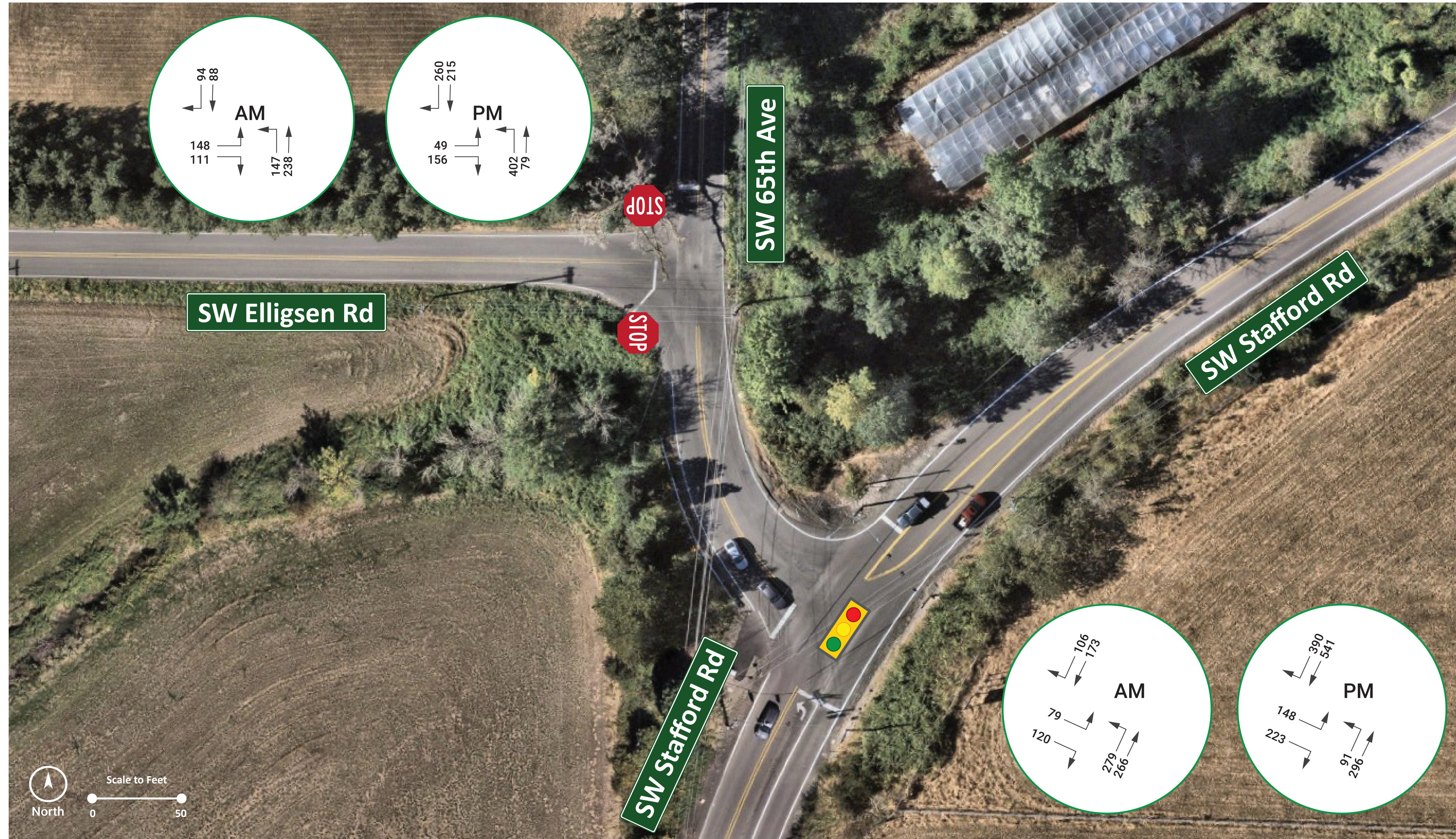
Existing Lane Configurations and Volumes (Peak AM and PM Hours)