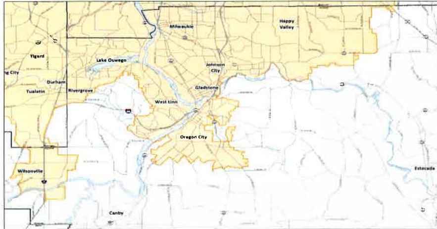
Figure 2: Clackamas County Urban Growth Boundary (Metro Data Resource Center)