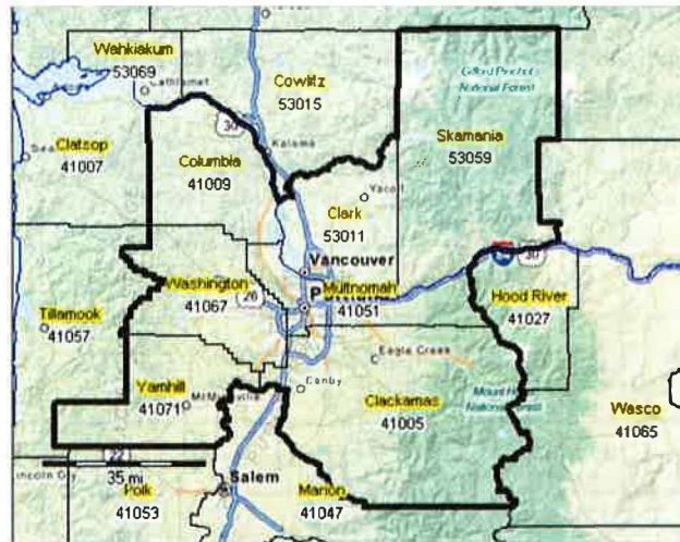
Figure 1: Portland/Vancouver Metropolitan Statistical Area

Clackamas County is an urban and rural county within the Portland/Vancouver metropolitan statistical area (figure 1). The US Census Bureau estimates a population size of 422,537 as of July 1, 2021, with the majority of those residing in the urban area adjacent to Multnomah County (to the north) and Washington County (to the west). It encompasses 1,879 square miles.