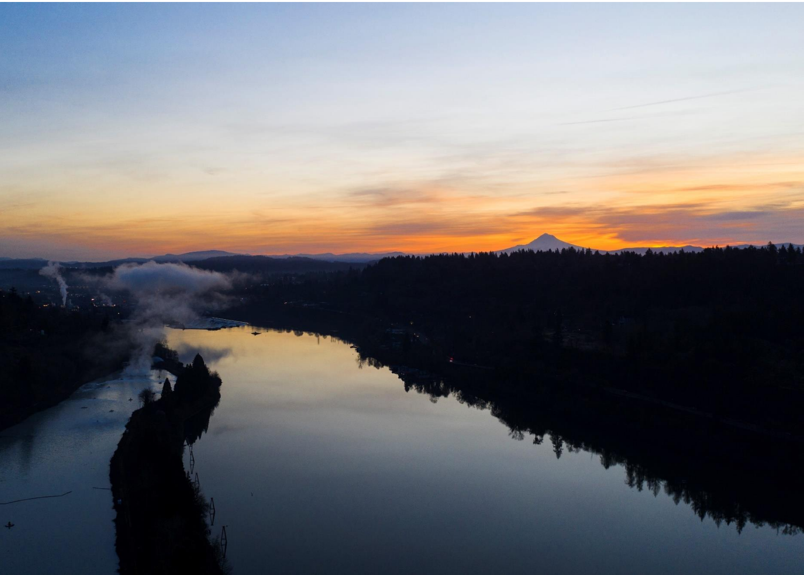
Sunrise over Willamette River in Oregon City.