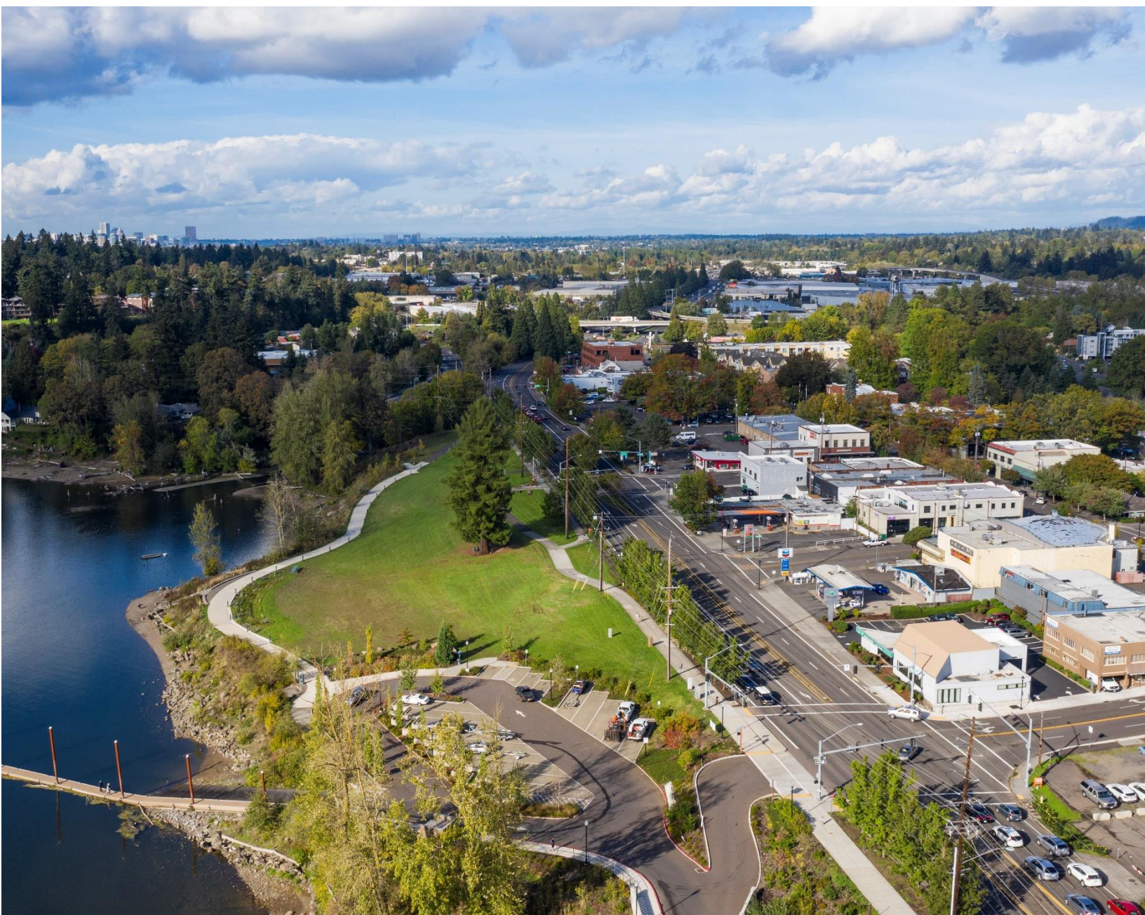
Milwaukie Bay.