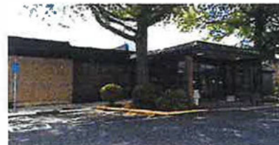
Providence Willamette Falls Medical Center Oregon City (2 galleries)