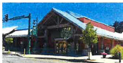
Sandy Public Library Sandy (1 gallery)