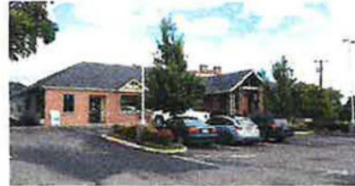
City Hall of Oregon City Oregon City (1 gallery)