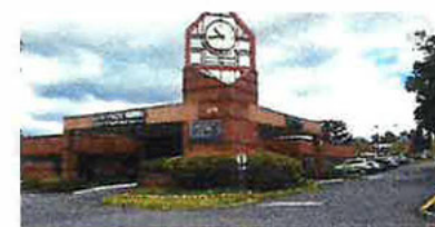
Sunnyside Health Center Clackamas (1 gallery)