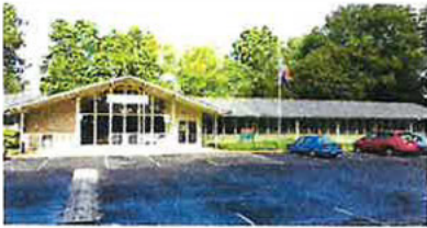
Beavercreek Health Center Oregon City (1 gallery)

10 VENUES with 16 gallery exhibit spaces in Clackamas County