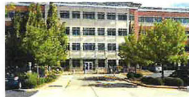
Clk Cty- Public Services Building Oregon City (2 galleries)