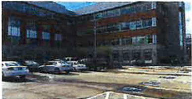
Clk Cty- Development Services Building Oregon City (5 galleries)