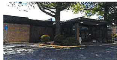
Providence Milwaukie Hospital Milwaukie (1 gallery)