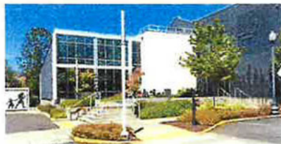
Happy Valley Library Happy Valley (1 gallery)