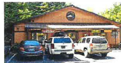
Hoodland Library Welches (1 gallery)