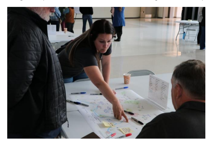
Image 2: Open house at Adrienne C. Nelson High School on April 10, 2024

The open house format was drop-in. Attendees could learn about the visioning process, share what they know about the area, provide feedback on proposed visioning goals, and talk with staff from the project and local jurisdictions, and with members of the project Steering Committee. Community members were asked to give feedback on posters, maps, and comment forms.