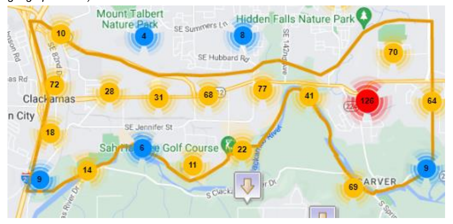
Figure 3: Map marker exercise (numbers shows how many comments were mapped by geographic area)