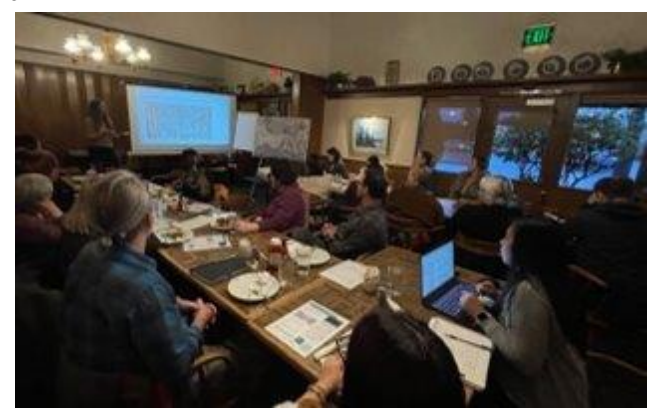
Image 1: Equitable engagement workshop at Elmer's Restaurant, Clackamas, February 21, 2024