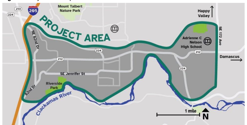
Figure 1: Project area map

The outcomes and the report at the end of this process will not be the end of this work, but the beginning of implementing improvements for the Sunrise Corridor Community.