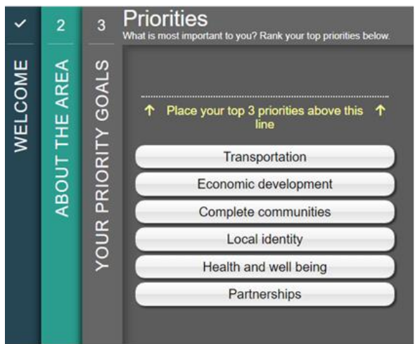
Figure 2: Priority goals exercise

The proposed goals were summarized for readability and referred to as "priorities." The summary language for the goals/priorities was simplified with examples to help respondents better understand the goal/priority. The following language was used to describe the goals/priorities online: