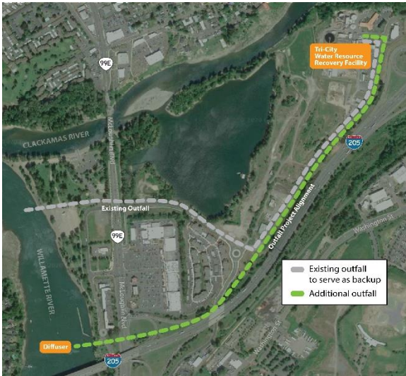
Map of proposed alignment

The Oregon City Charter calls for a vote of the people regarding the easements and for the construction of permanent structures unrelated to park use. On June 17, 2020, the City of Oregon City Commission referred a measure that will ask voters "shall the City authorize the underground placement of a wastewater pipeline