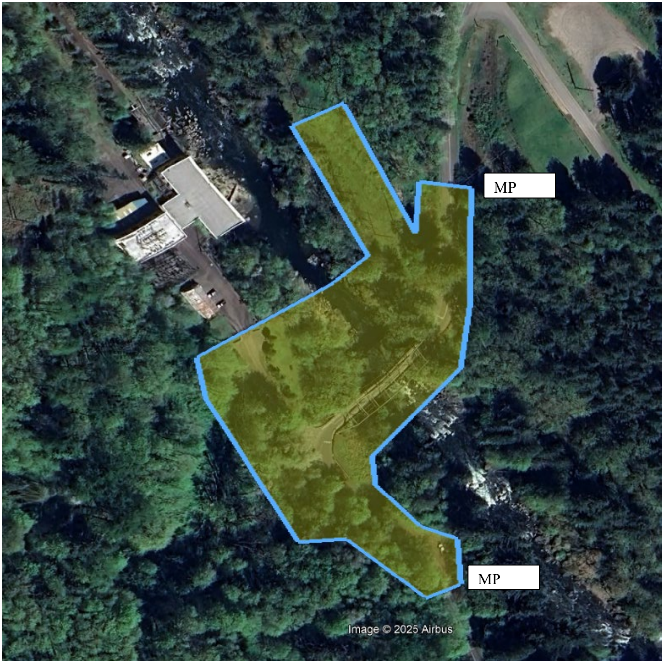
Image 1 - Outer limits of field survey.

Consultant shall adhere to the standards stipulated by the Oregon Revised Statute (“ORS”) 672. Consultant's Professional Land Surveyor, registered in the State of Oregon, shall review and stamp as “Approved” all survey related deliverables and shall be responsible for all land surveying services including conformance to all state statutes pertaining to survey and land boundary laws under this SOW. These include, but are not limited to, the following state statutes: ORS Chapters 92, 93, 209 and 672.