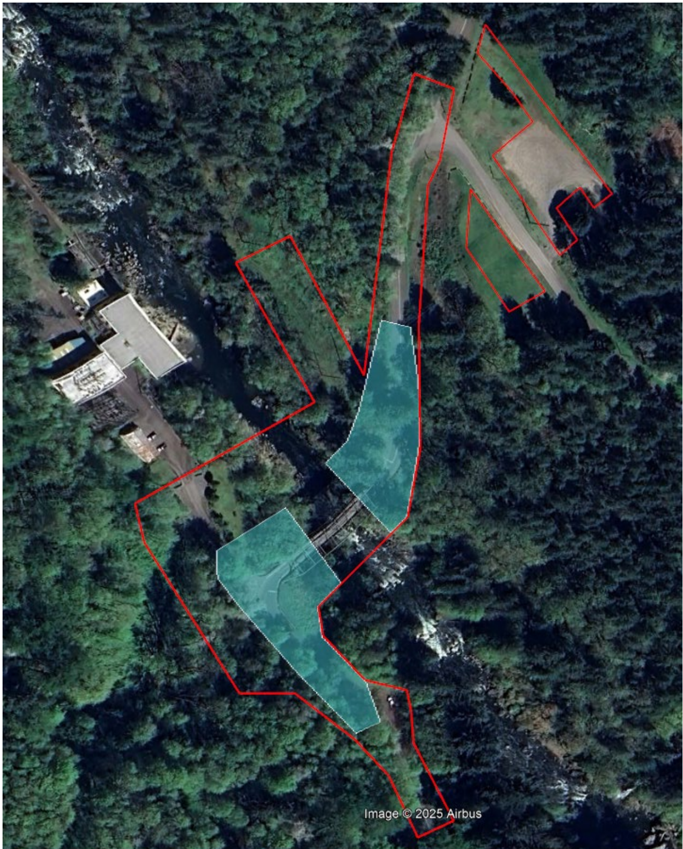
Image 2 - Assumed APE (red) and areas of ground disturbance (blue).

resources, unless documented proof of previous fill is available i.e. as-builts/geomorphological work.