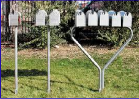
Above: Mailbox(es) supported by light gauge pipe that is 2 inches in diameter or less

A typical mailbox installation should consist of a light, sheet-metal box mounted on one of the breakaway support systems shown below, anchored no more than 24 inches into the ground.