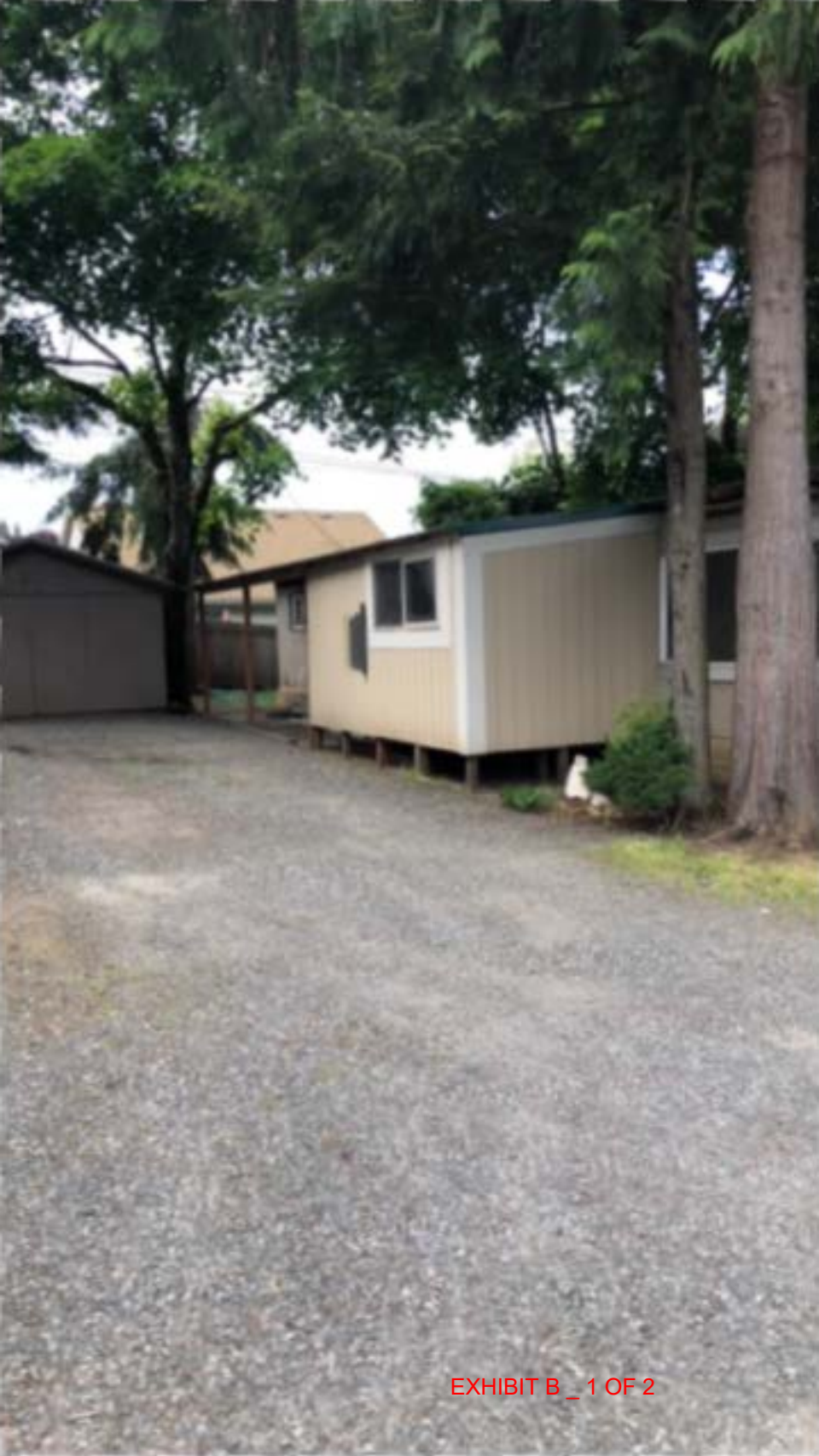
EXHIBIT B_ 1 OF 2