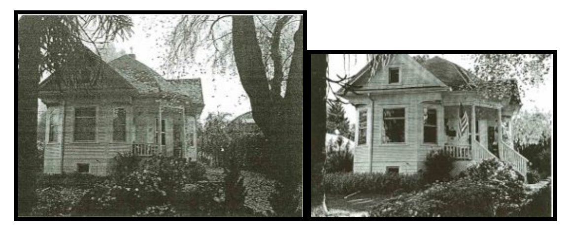
Tulip tree – right side of photo Historic Landmark P.G. Wanblad House

Location: 18600 SE Abernethy Lane, Milwaukie, OR