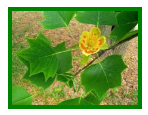
Liriodendron tulipifera foliage and flower