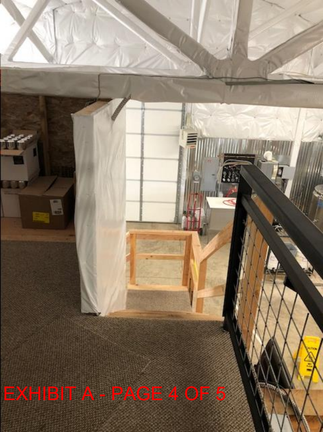
EXHIBIT A - PAGE 4 OF 5