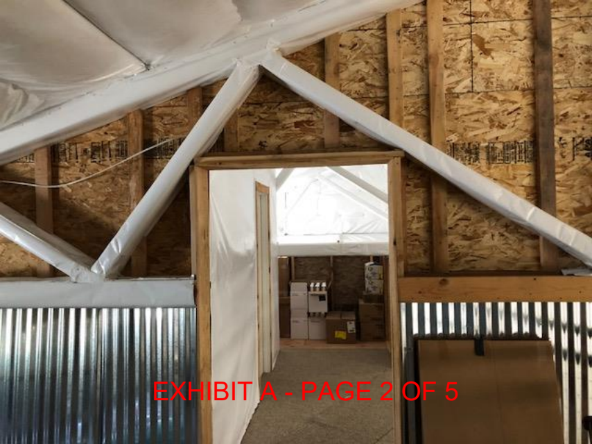
EXHIBIT A - PAGE 2 OF 5