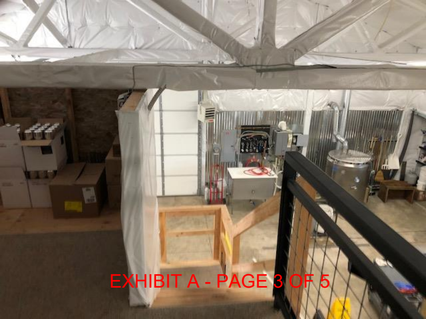
EXHIBIT A - PAGE 3 OF 5