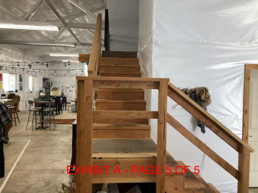
EXHIBIT A - PAGE 5 OF 5