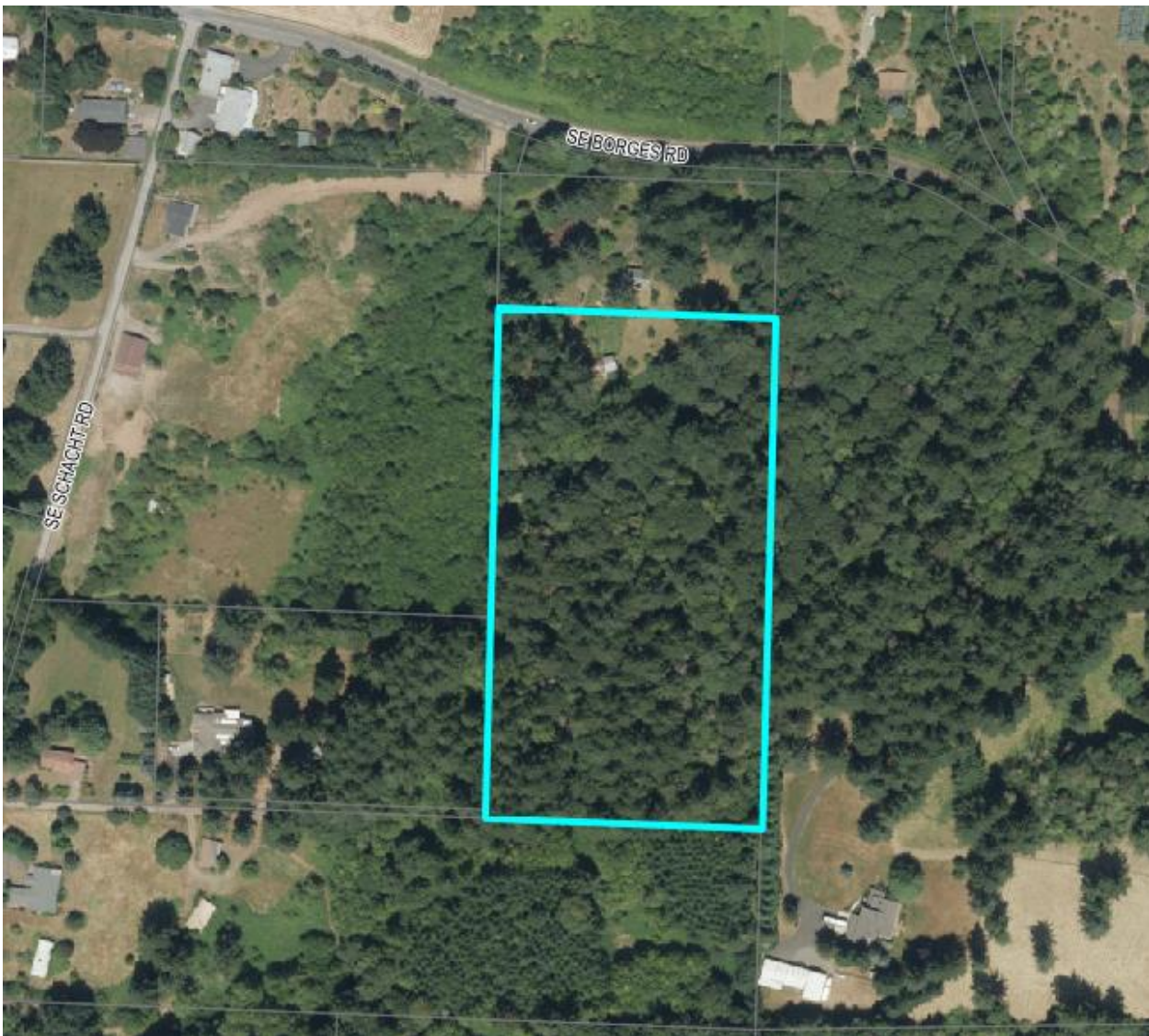
Figure 1: Property Aerial