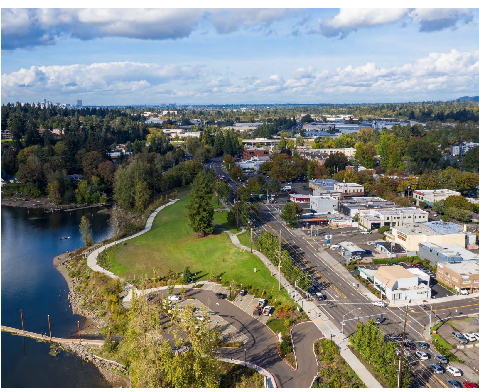
Milwaukie Bay.