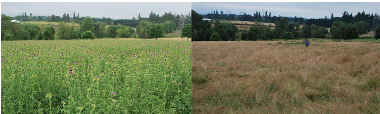
Before (left) and After (right): The WeedWise program recently assisted a resident with a large milk thistle infestation in a horse pasture. The results above were realized after only one year of active management.