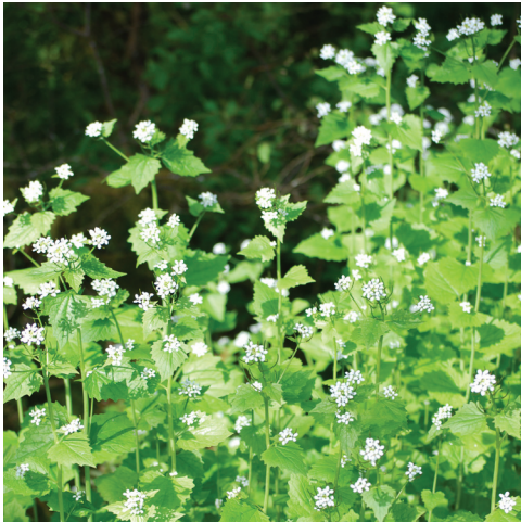
Garlic mustard: A regional target for control and containment