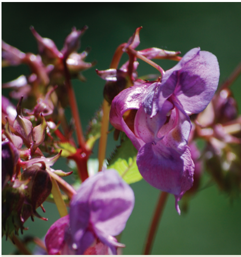
Policeman's helmet: A target for control along the Sandy River