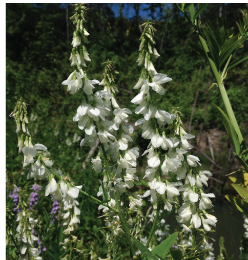
Goatsrue: A new priority weed discovered on the Clackamas River