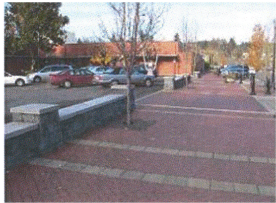
Examples of Urban Fence or Wall Screening