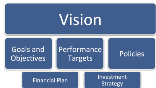
Figure 1. Elements of the Regional Transportation Plan

Together these elements guide planning and investment decisions to meet the transportation needs of the people who live, work and travel in greater Portland today and in the future.