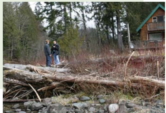
In the background stands one of the Hiddendale properties protected by the project.

“The typical approach before we did this would have been to line the banks with riprap, using the same size material we used in the groins,” said Latham. “The thing is, when you go that way, currents accelerate along riprap, and you’re just sending the problem downstream. You don’t get any improved habitat or channel diversity. It’s just a rock wall. With these three small groins, it didn’t establish a big footprint, but it’s really kept the thalweg, or the main part of the river, well out beyond the bank, preventing any further erosion. It also created all this habitat in between each groin. Now the bank has been stabilized as well or better than riprap ever could do it.”