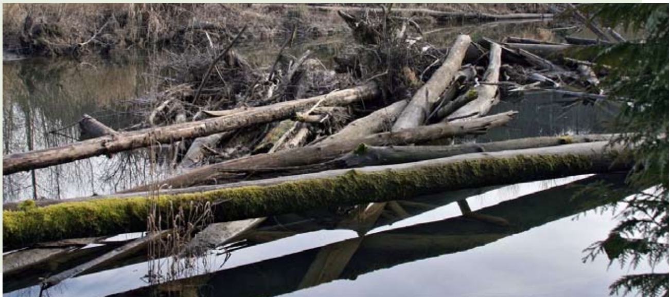
During flooding additional woody debris is recruited by the original logs.

In 1990, the Middle Green River created a whole new quarter mile meander bend in just over one day. In the process, the river demolished 150 feet of rock lined levee, a dozen maple trees and a couple acres of the Hamakami Strawberry farm. Historically on the Green River, rock riprap was used to prevent embankment scour. On such an alluvial floodplain as the Hamakami property, with an abundance of silt and sand, however, slumping is the primary cause of bank failure. Fine grained materials do not provide bank resistance, so in a high energy event, like the one that occurred at the Hamakami site in 1990, the Green River was able to move laterally at a very rapid pace.