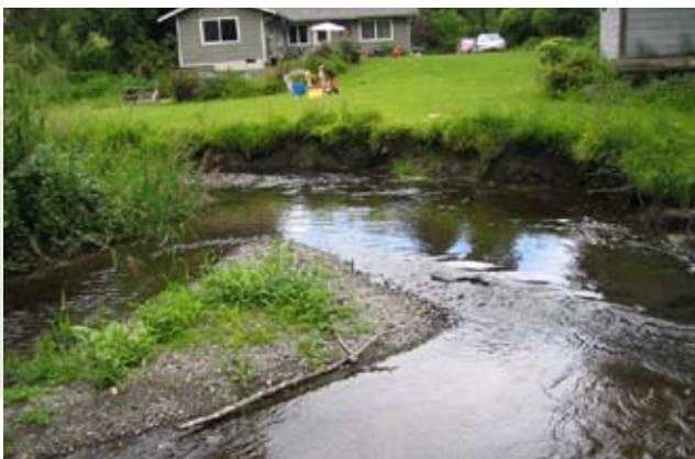
The eroding property prior to the start of the project.

"It was during a period when the Fish and Wildlife Department would normally not allow you to do any kind of work in this stream," said Geiger. "However, these types of structures can be installed with just about zero sedimentation. This qualified us for the streamlined Hydraulic Project Approval, which takes a much shorter time to permit, and eliminates the