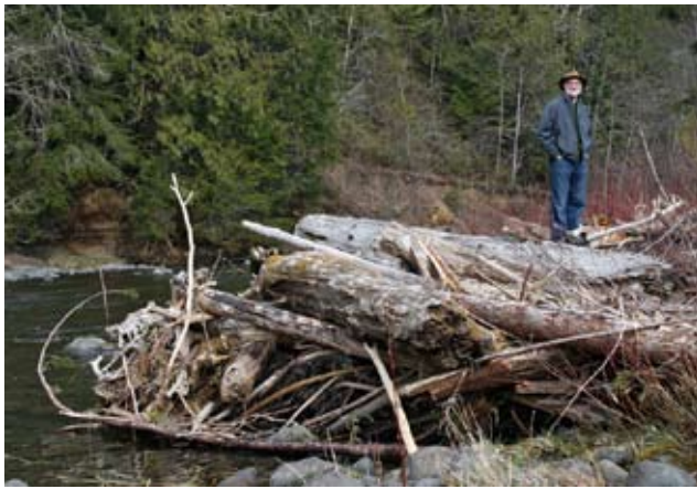
Al Latham stands on top of one the groins extended into the river.

The National Forest Service donated almost forty 25 to 30-foot long logs, several with root wads still attached, which the Forest Service retrieved from areas of blow-down during previous storms. The logs were laid within the trenches, several logs to a trench, with the root wads sticking out into the river. To lock the structures in place, the logs were integrated with the rocks. Additional rocks were then piled on top of the logs, giving the structures strength and stability.