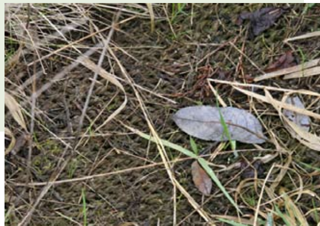
Coir fabric covers the upper bank.

Along the linear portions of the embankment, the county laid large limestone rock up to the ordinary high water mark. Seventy-five pieces of large woody debris were then placed along the project length with