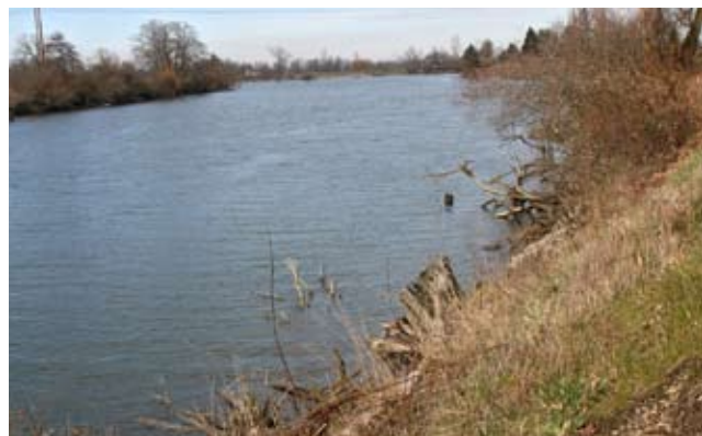
The completed project, a short distance down the road, is now fully vegetated and looks entirely natural.