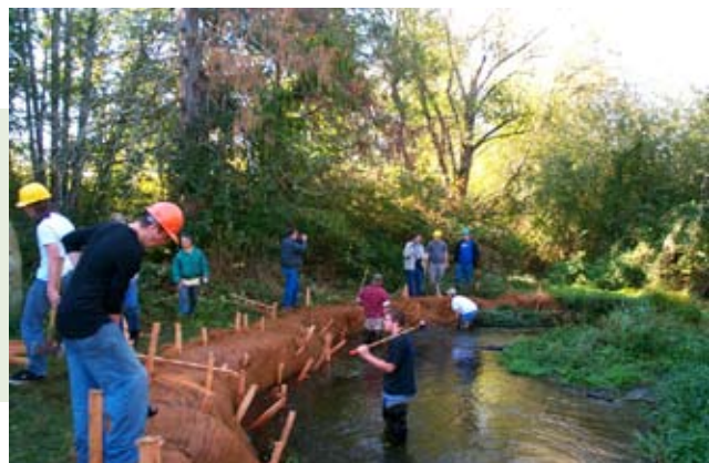
Construction of the brush mattress underway.