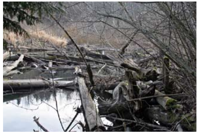
Numerous logs are placed along the toe of the riverbank.

"We wanted to see how wood could be used constructively without destabilizing banks." - Andy Levesque