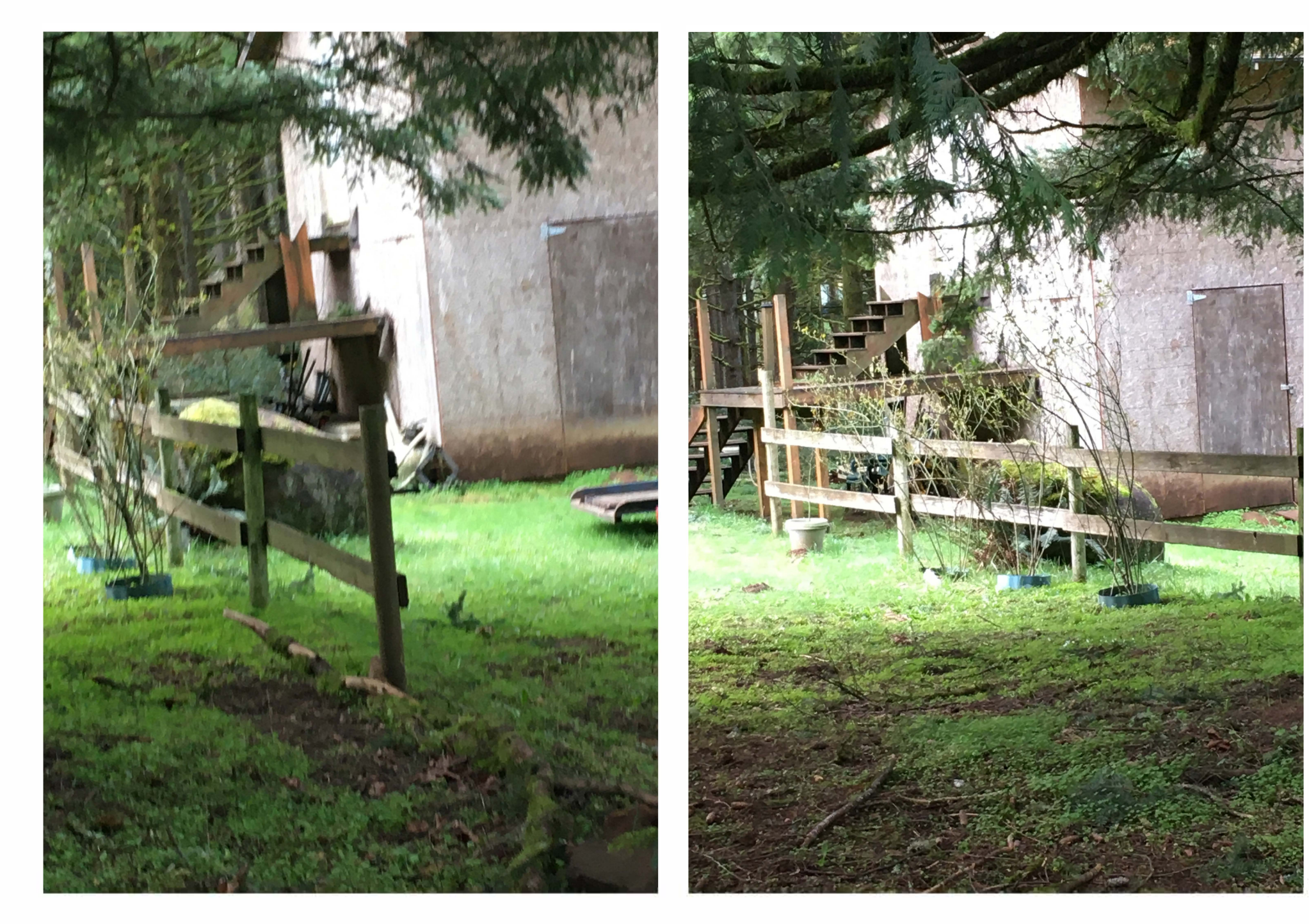
EXHIBIT B - PAGE 4 OF 4