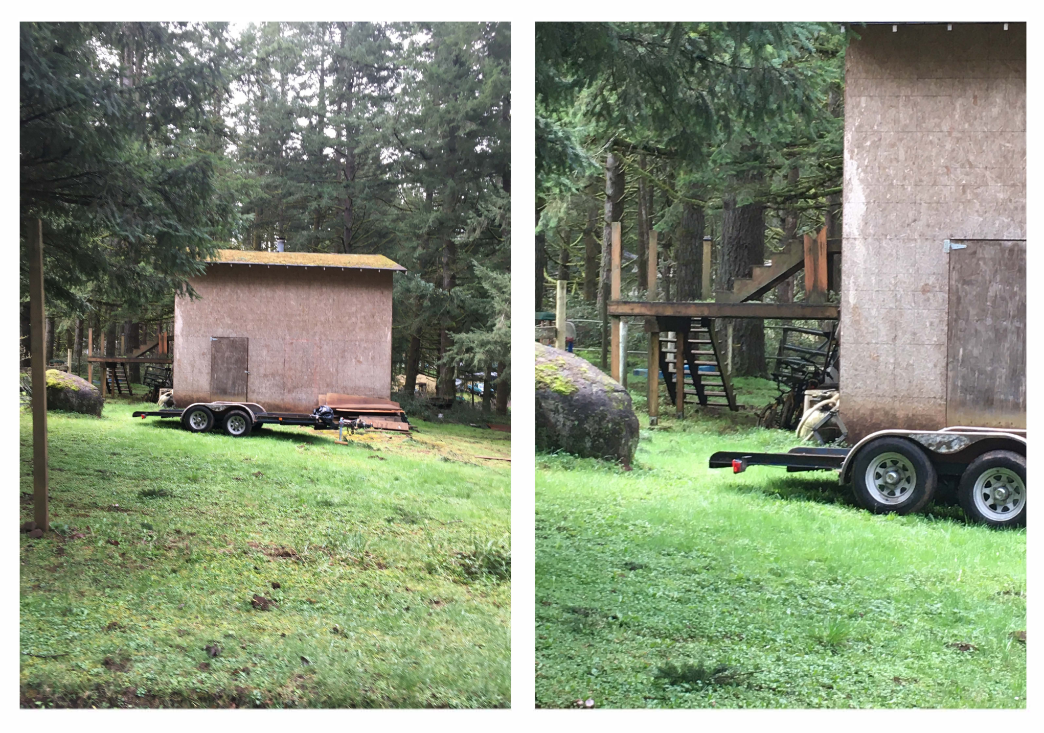
EXHIBIT B - PAGE 3 OF 4