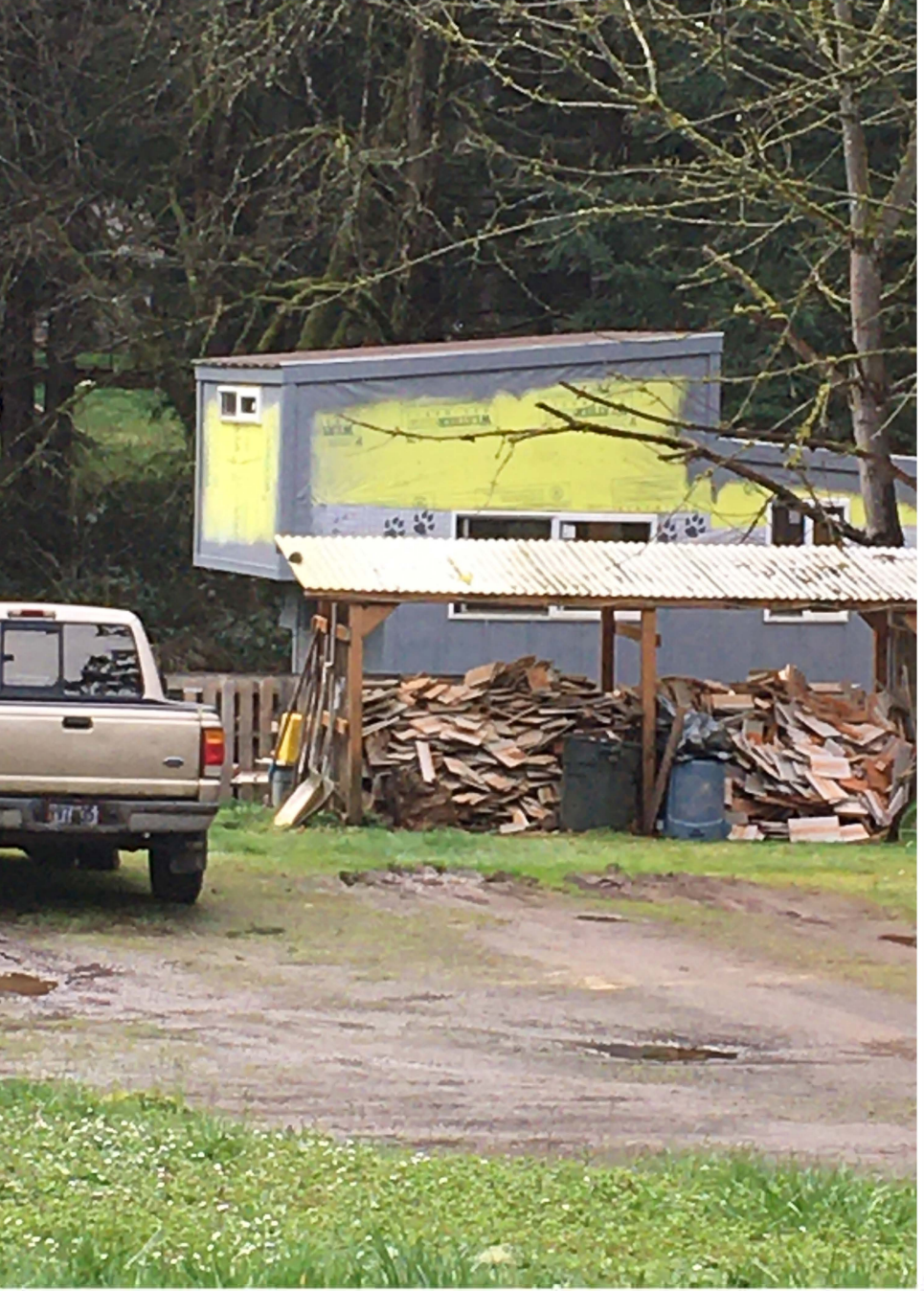
EXHIBIT B - PAGE 1 OF 4