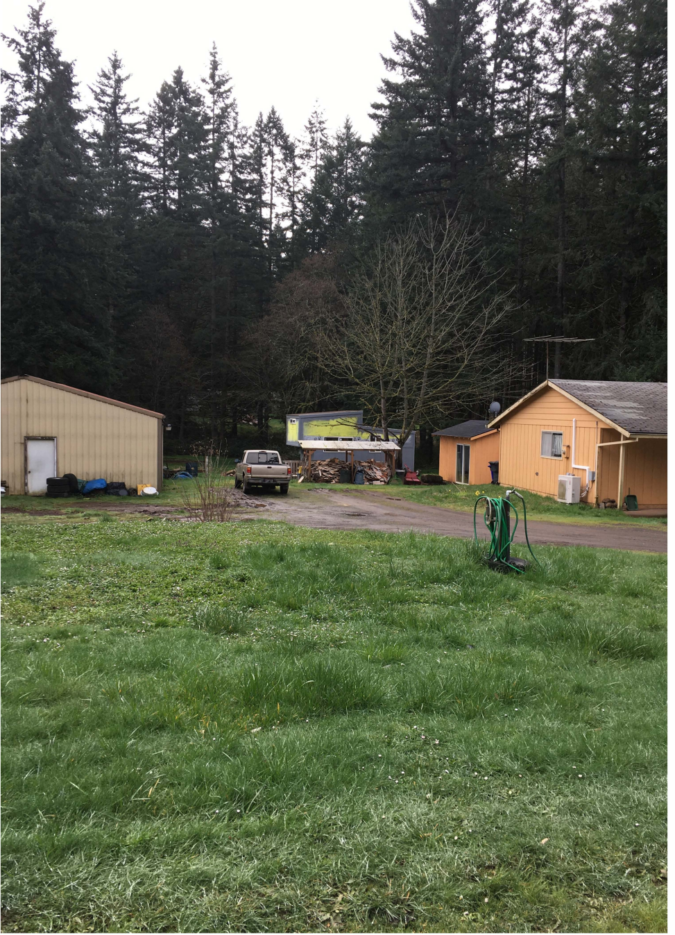
EXHIBIT B - PAGE 2 OF 4