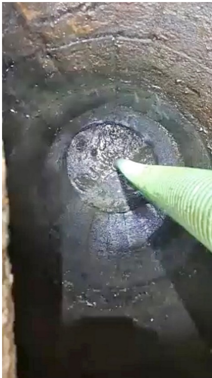
Photo from the Redland Store's March 27, 2024, pumping of the Redland Store Cesspool. As can be seen, the bricks are stacked vertically on top of one another and the seams between the bricks are filled with mortar. This prevents the Dug Pit's waste waters from flowing from the Dug Pit into the surrounding soils. The Dug Pit's sidewalls lack the voids between the bricks, which are necessary for a cesspool to function properly. By capturing the waste waters within the Dug Pit, rather than allowing the wasted waters to flow