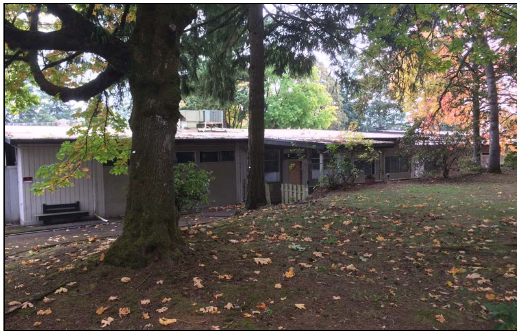
10 VIEW OF THE COVERED DINING AREA FROM THE SIDEWALK