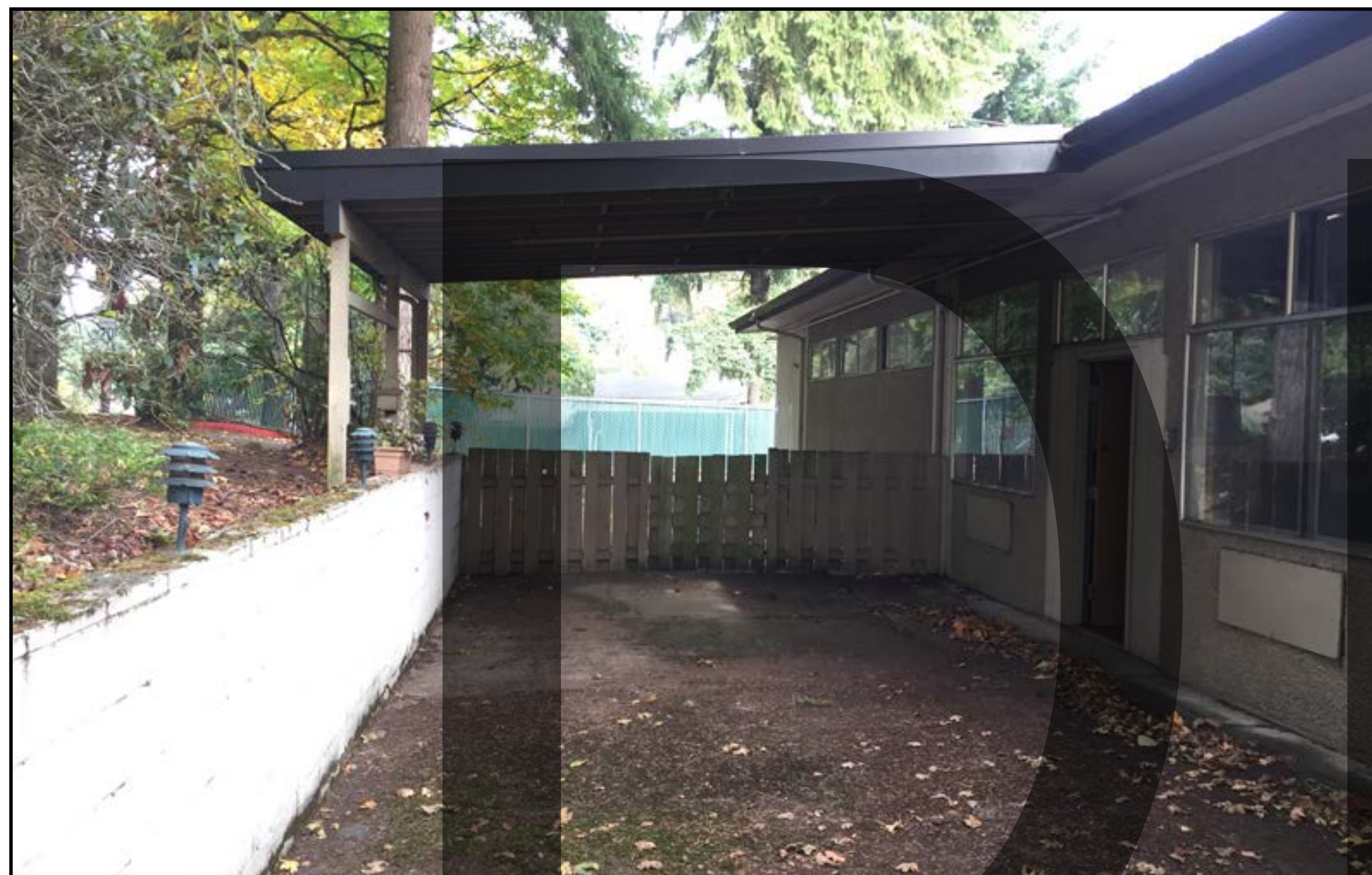
13 LOOKING NORTH AT COVERED DINING AREA