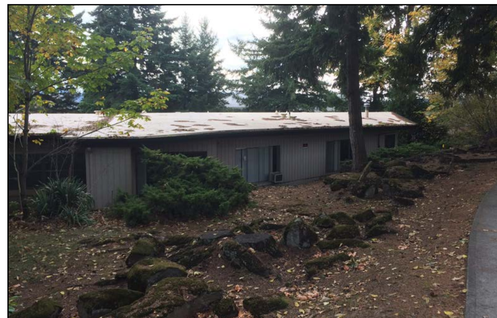
8 FROM THE SIDEWALK LOOKING SOUTH