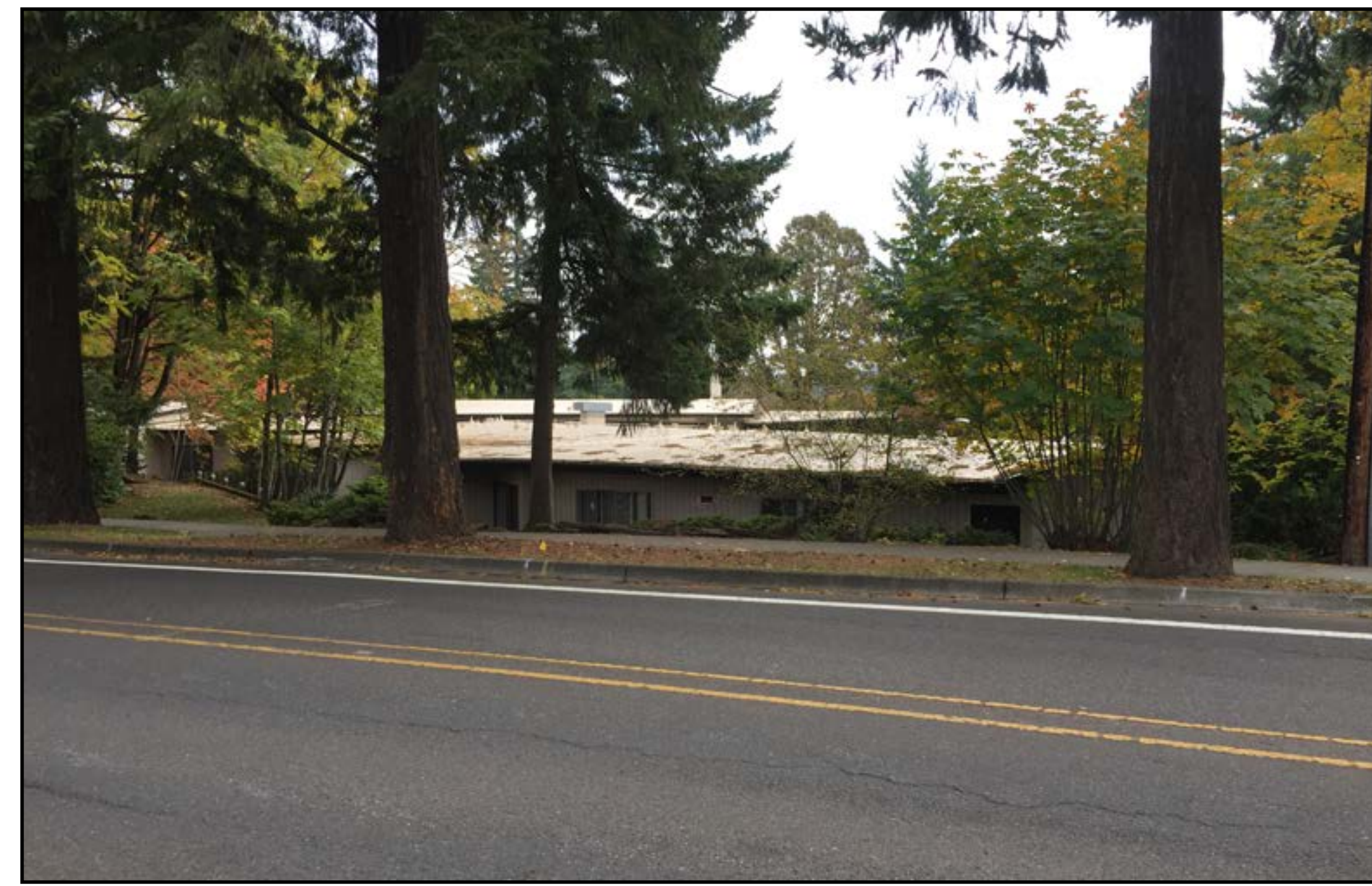
2 LOOKING EAST FROM ACROSS WEBSTER ROAD