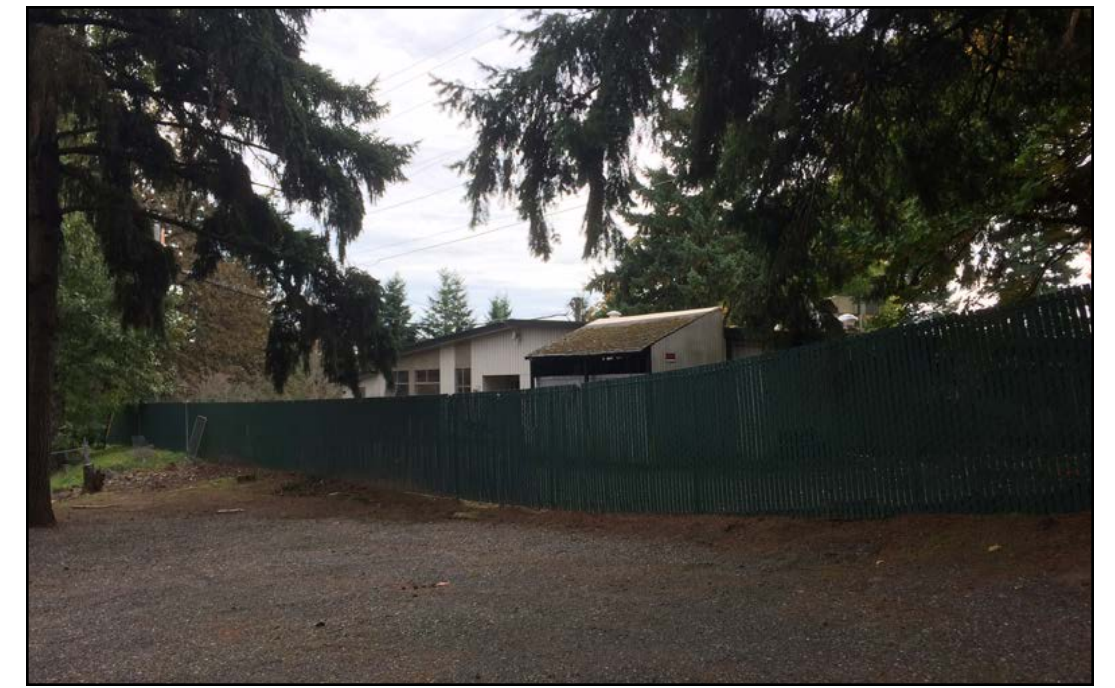
12 LOOKING SOUTHEAST FROM THE NORTH EDGE OF SITE