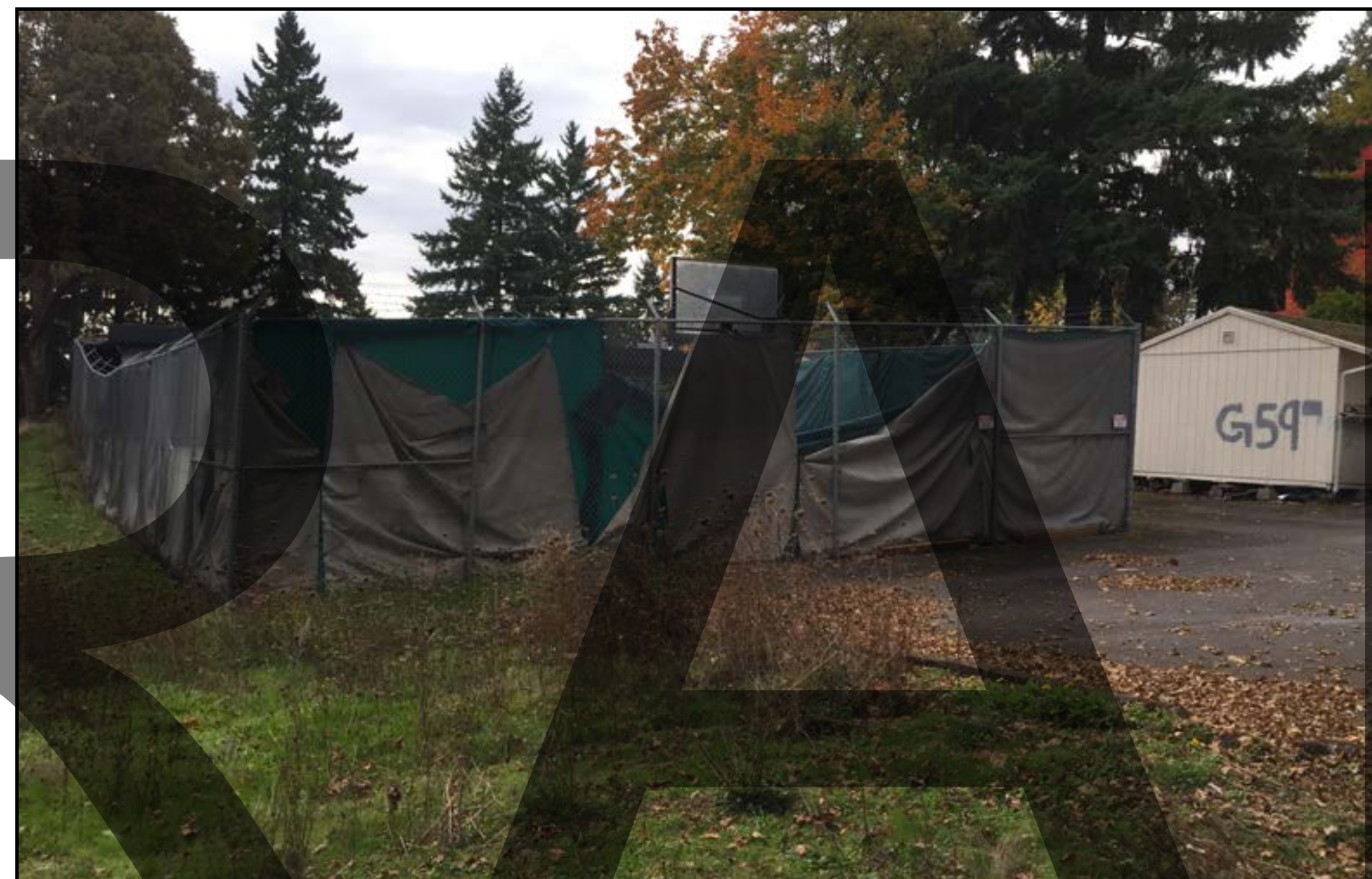
14 LOOKING SOUTHWEST FROM NORTHEAST CORNER OF SITE