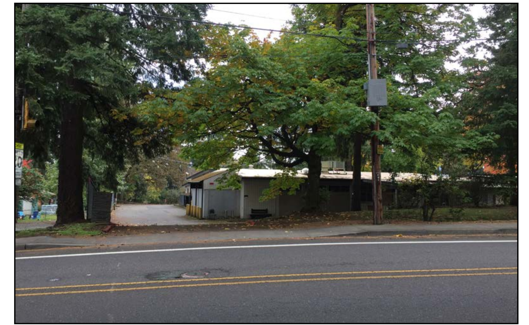
3 NORTH DRIVEWAY FROM ACROSS WEBSTER ROAD