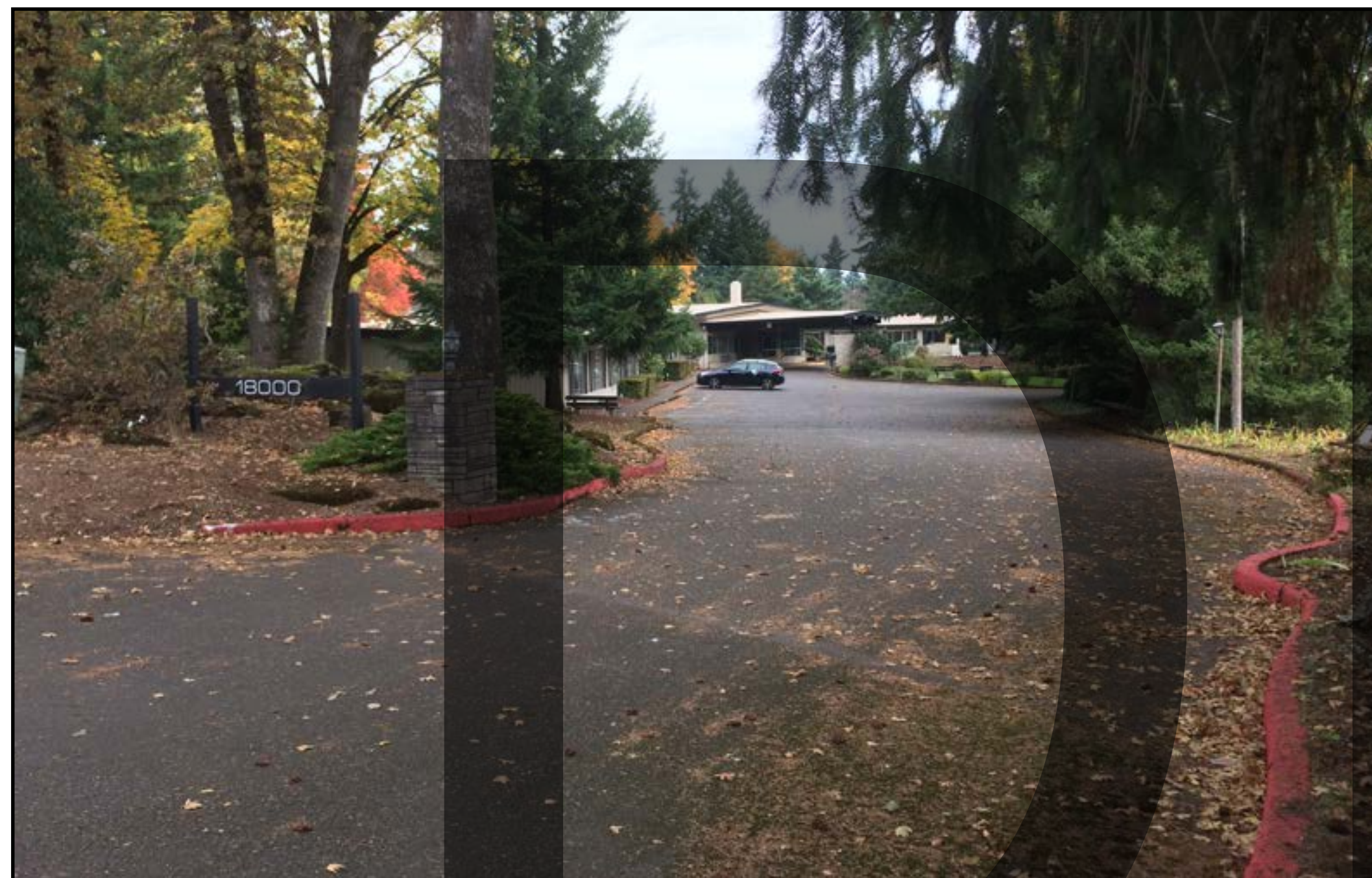
4 SOUTH DRIVEWAY FROM THE SIDEWALK