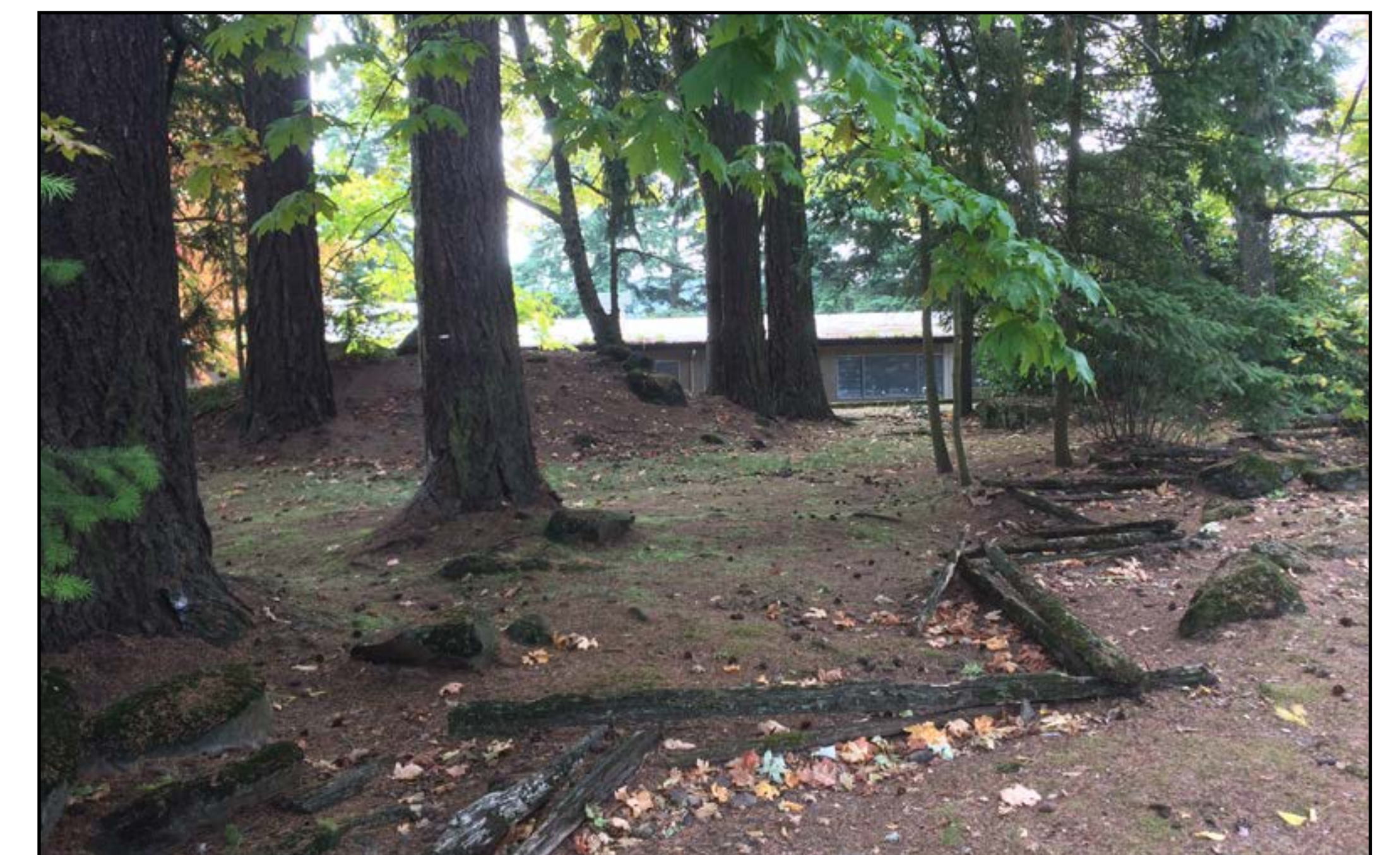
9 VIEW THROUGH THE TREES FROM THE SIDEWALK