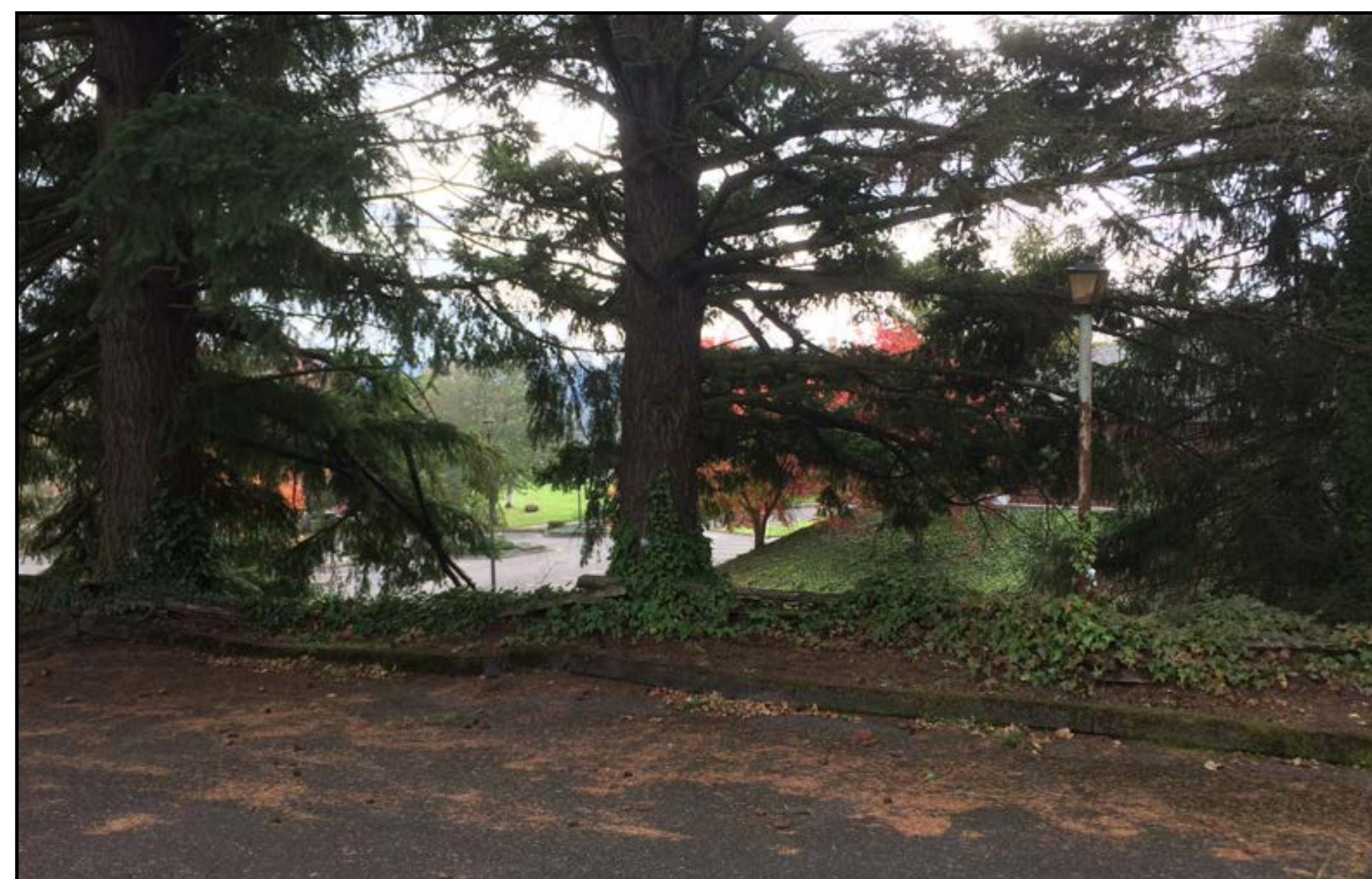
17 SOUTH VIEW FROM THE SOUTH PARKING LOT