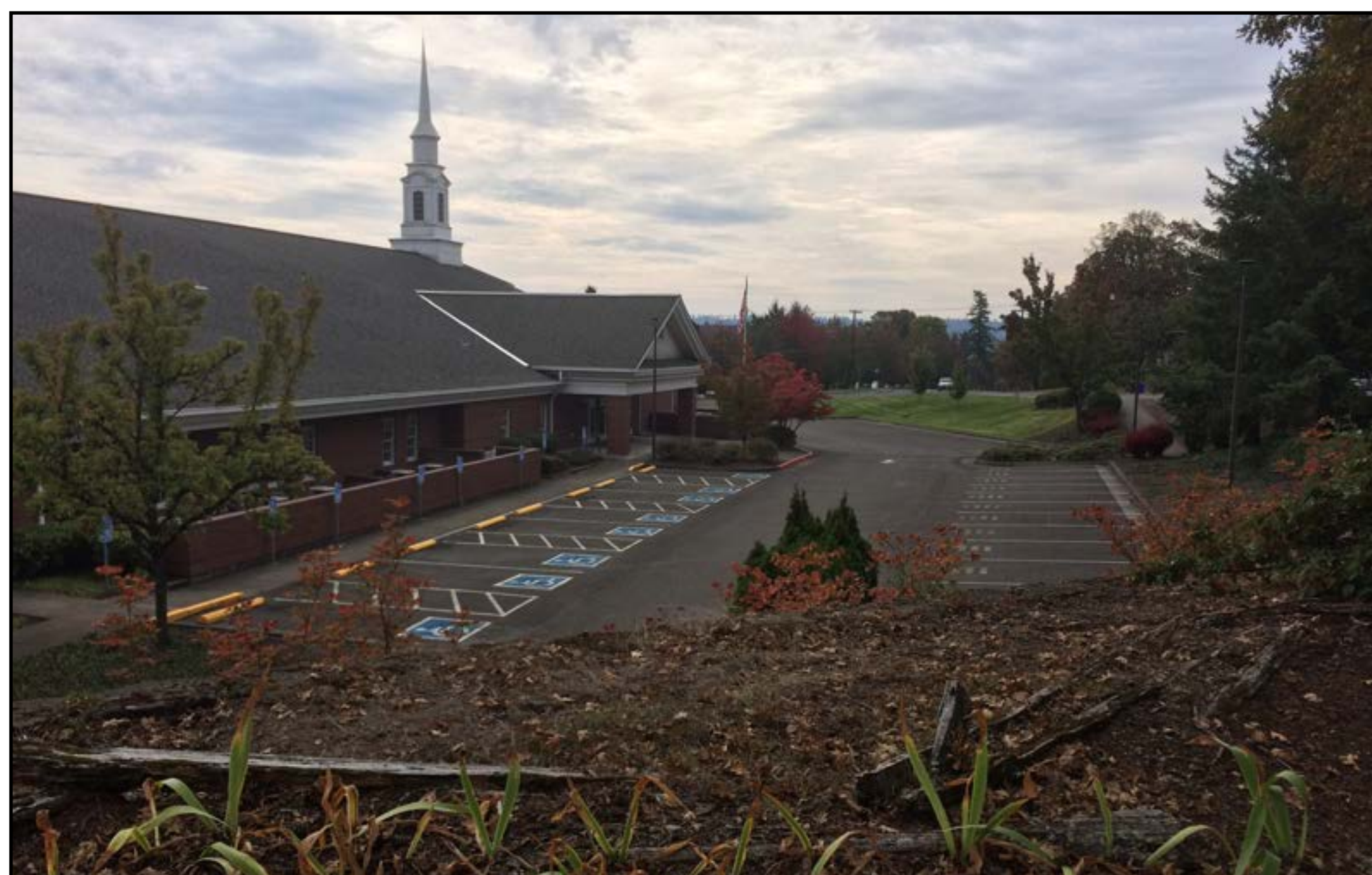
16 VIEW LOOKING SOUTH FROM THE PARKING LOT ENTRY