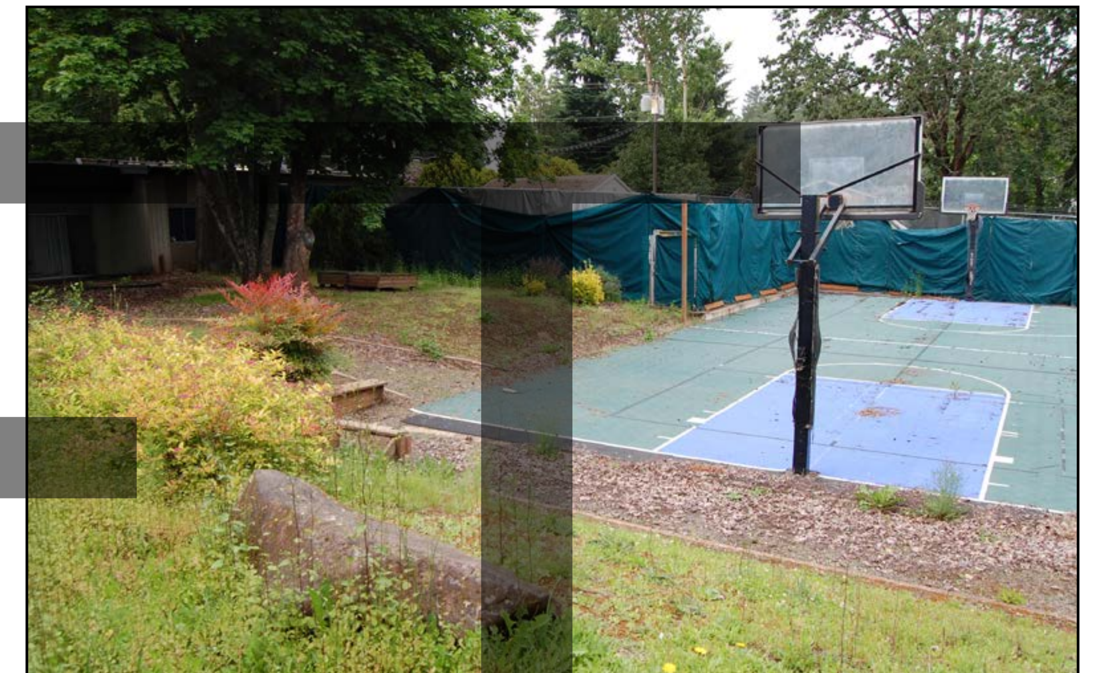
15 LOOKING NORTH AT BASKETBALL COURT AND YARD