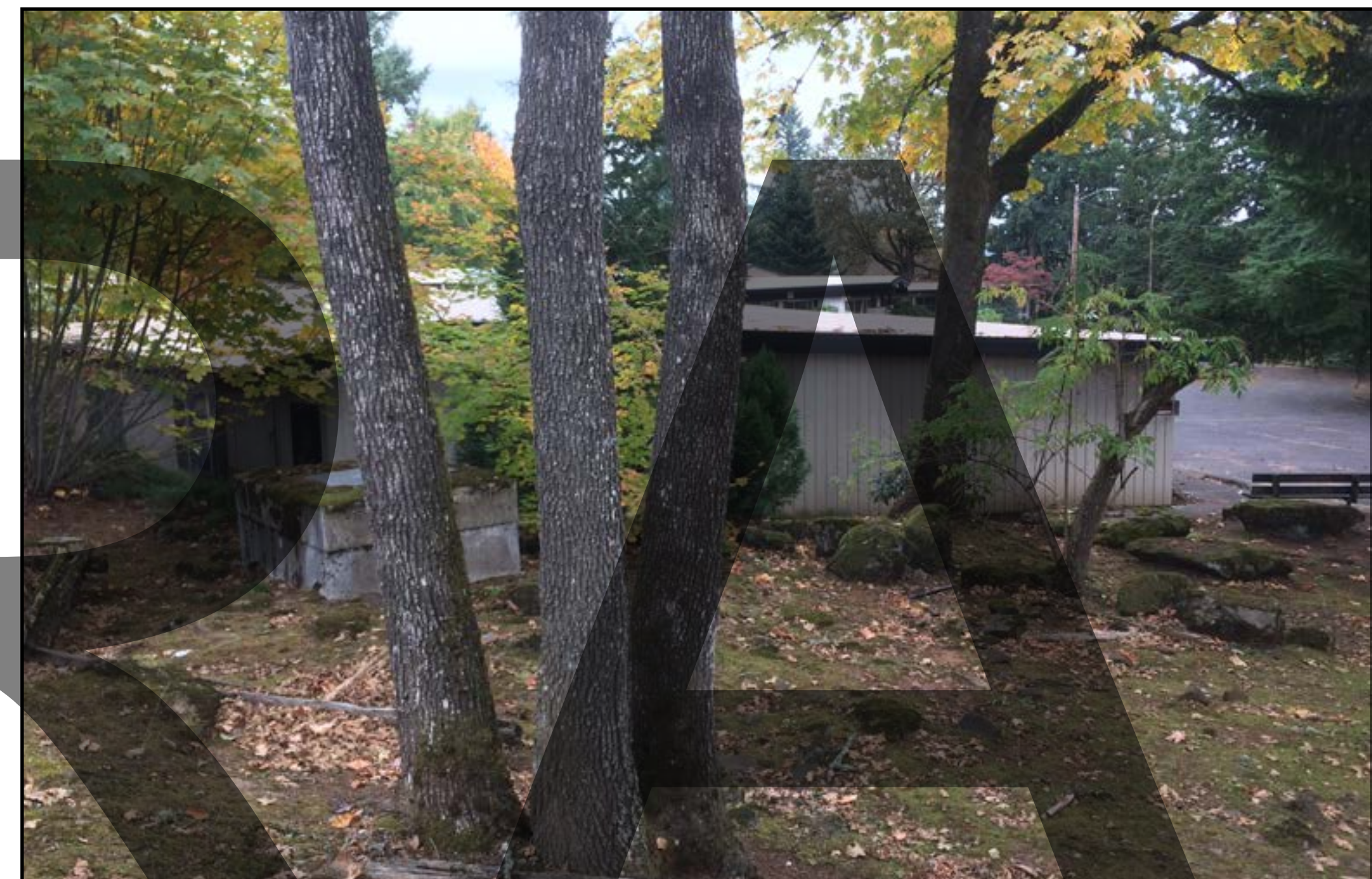
5 SOUTHWEST CORNER OF THE BUILDING FROM THE SIDEWALK