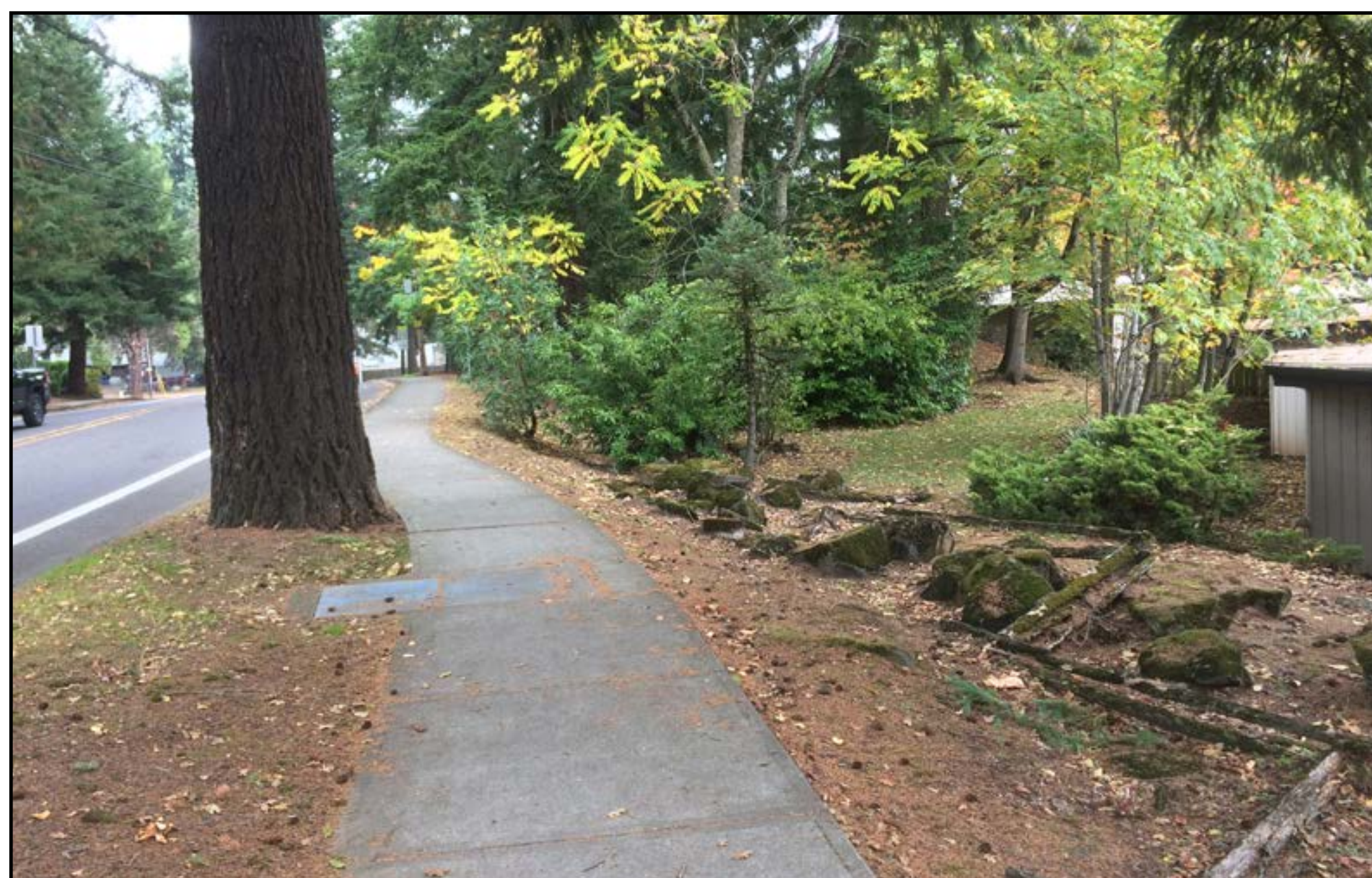
7 LOOKING NORTH UP THE SIDEWALK