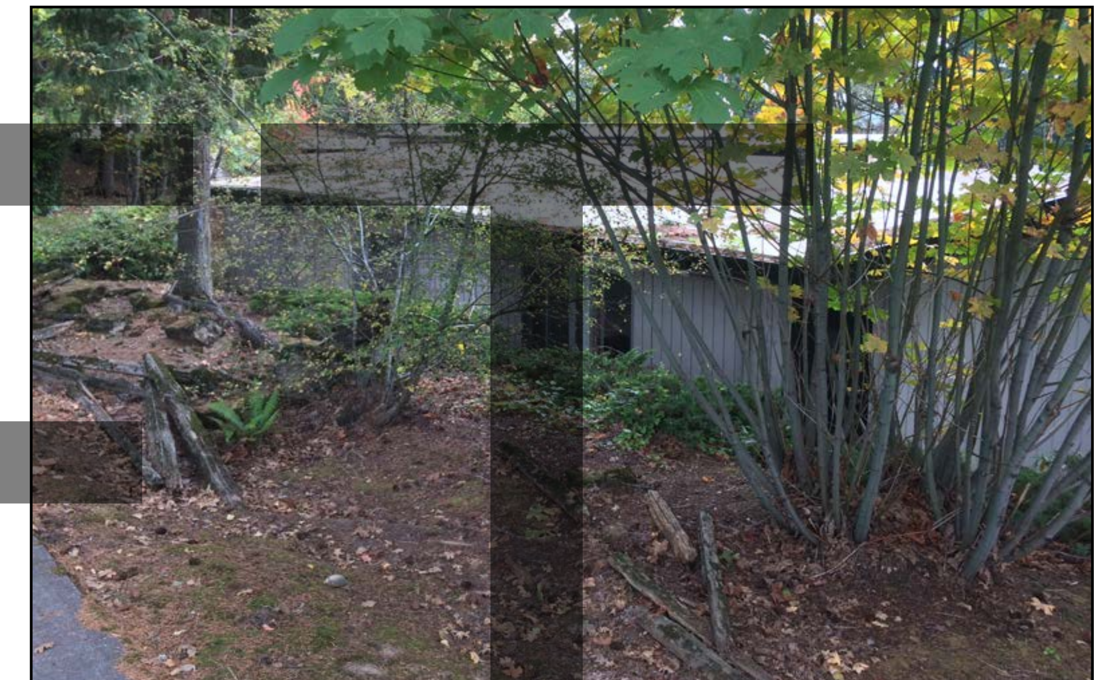
6 FROM THE SIDEWALK SHOWING ELEVATION CHANGE