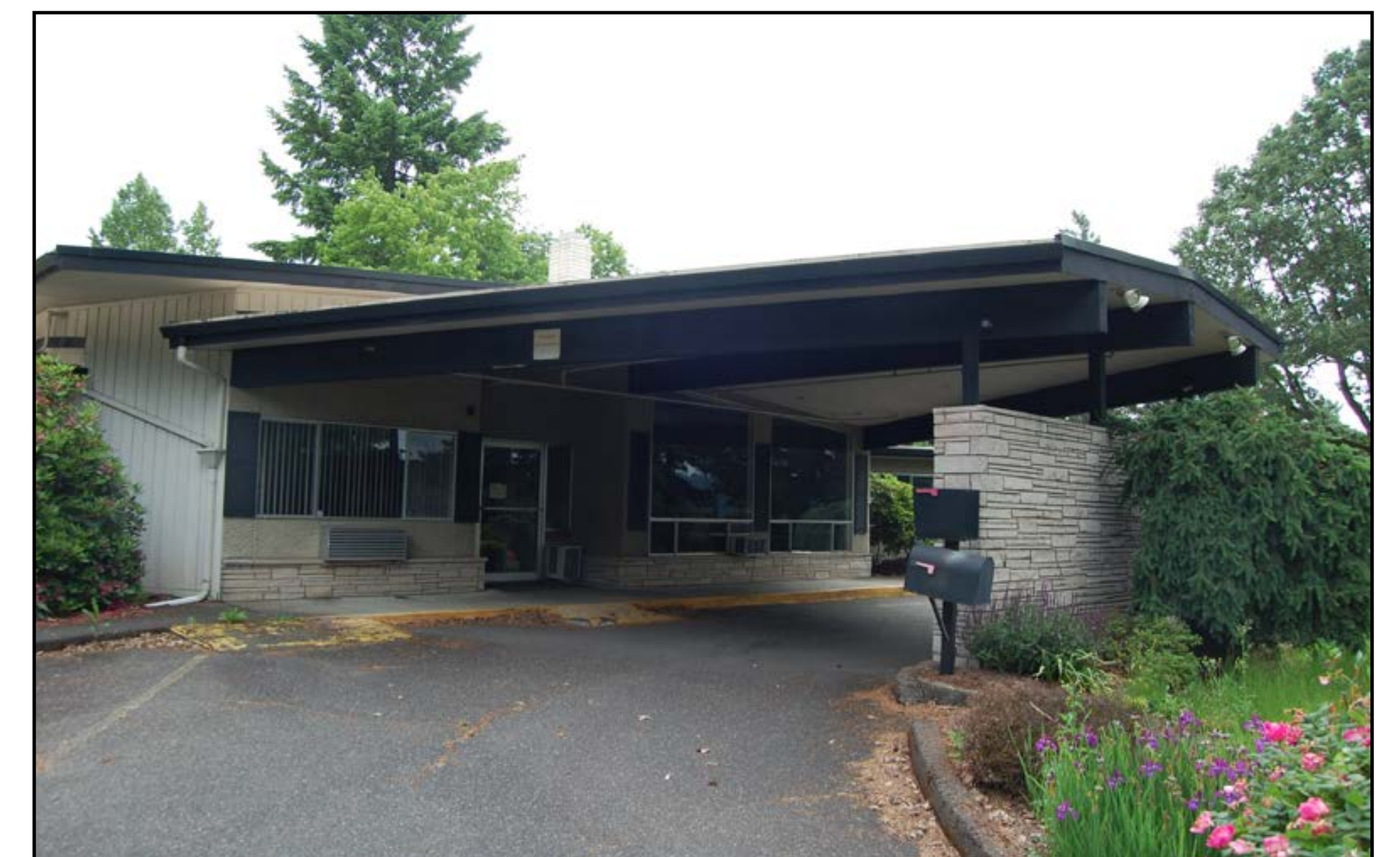
18 PORTE COCHERE AT MAIN ENTRY