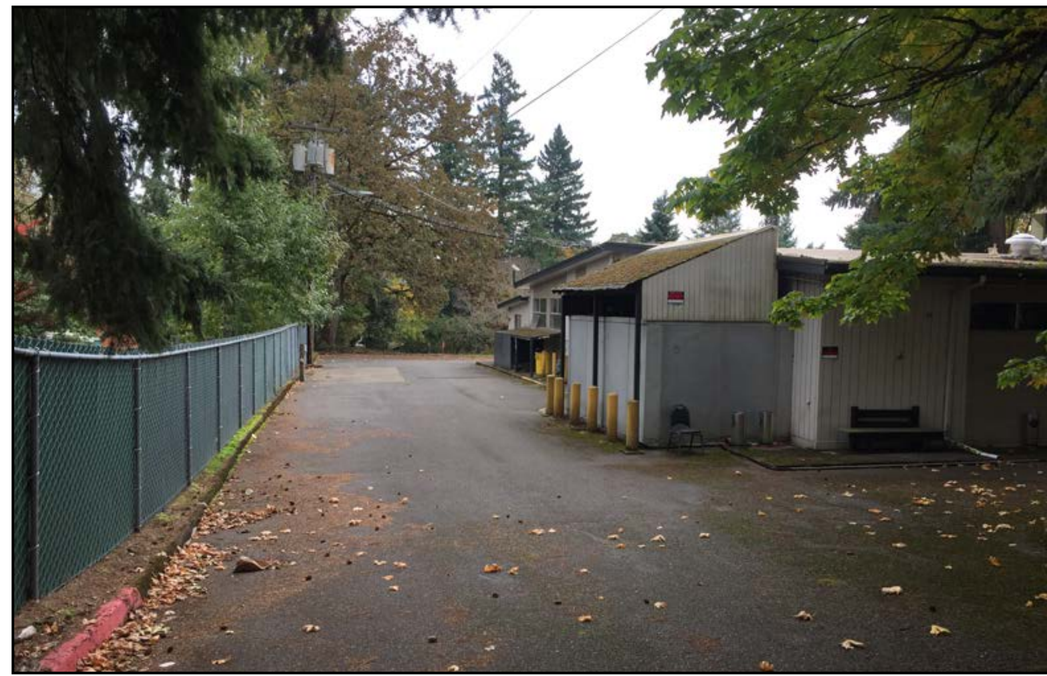
11 NORTH PARKING LOT FROM THE SIDEWALK