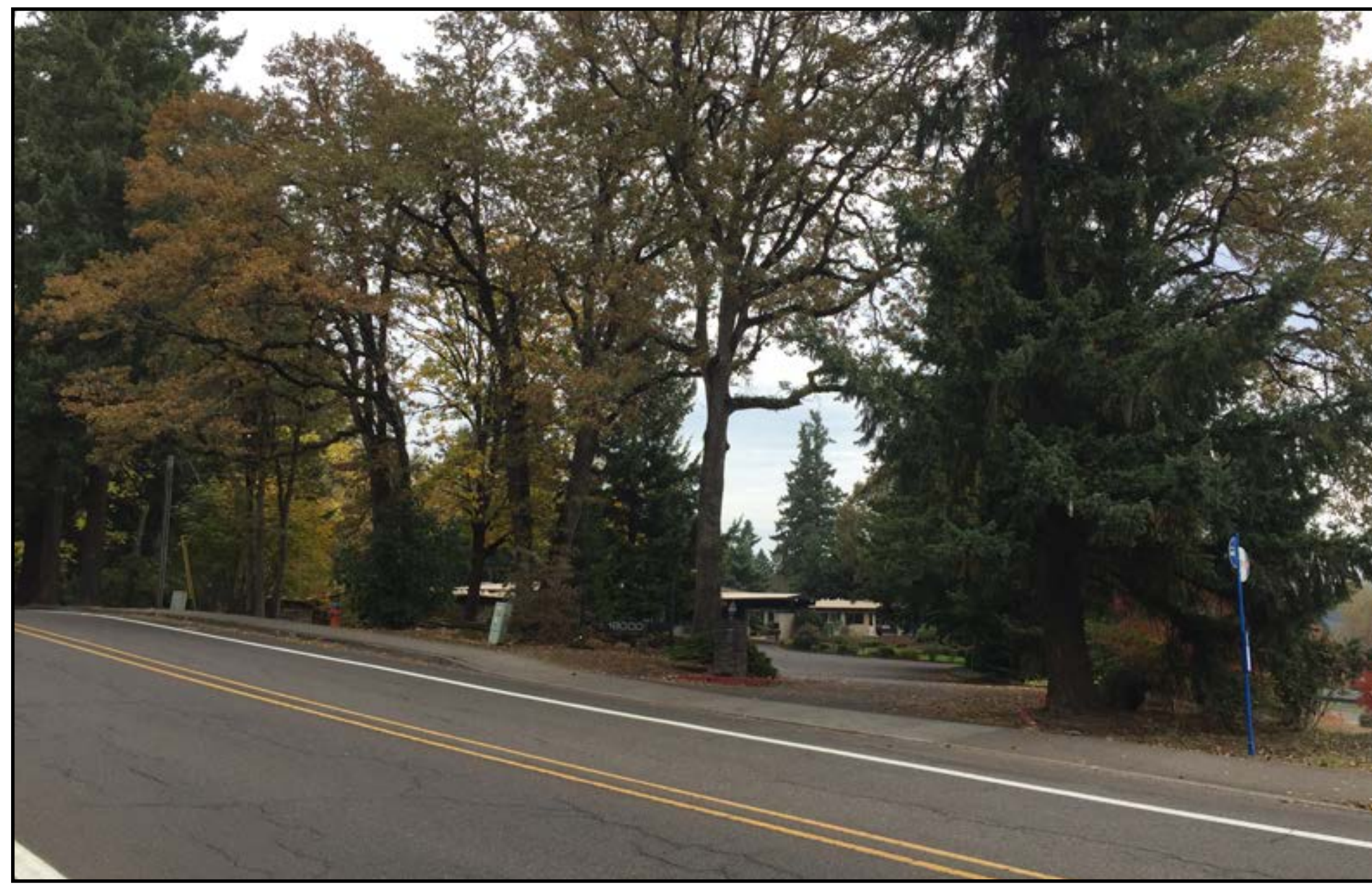
1 SOUTH DRIVEWAY FROM ACROSS WEBSTER ROAD