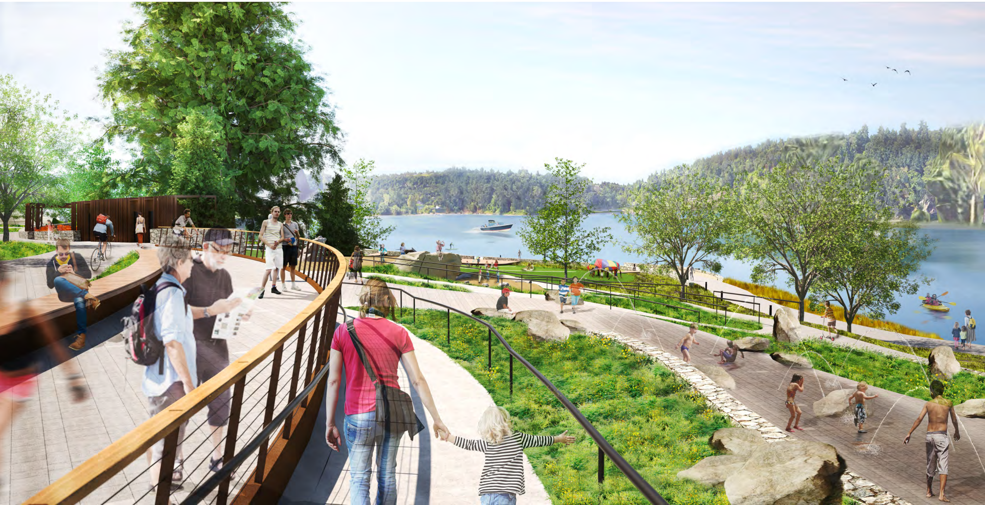
PREFERRED ALTERNATIVE | Ramp to Play Area and Water Feature