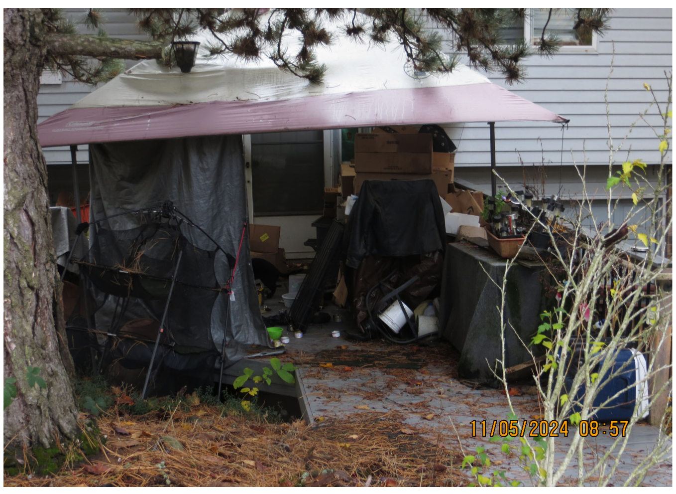
EXHIBIT B _ PAGE 1 OF 4