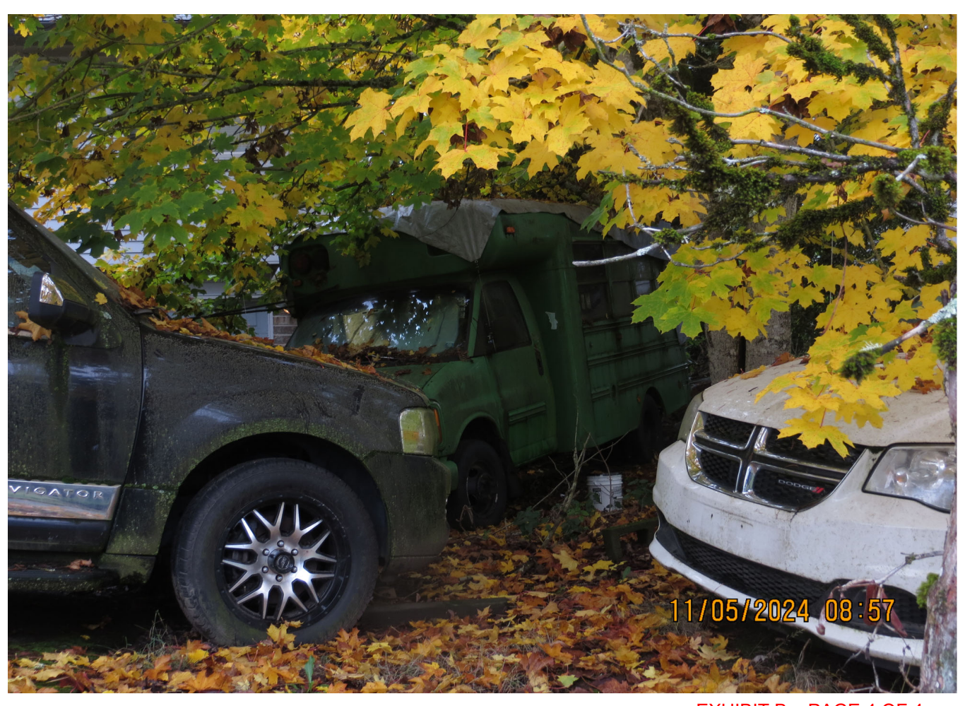
EXHIBIT B _ PAGE 4 OF 4