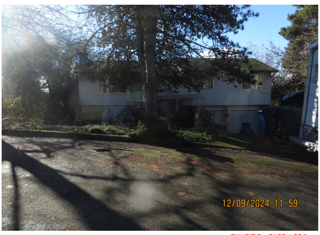
EXHIBIT D _ PAGE 1 OF 2