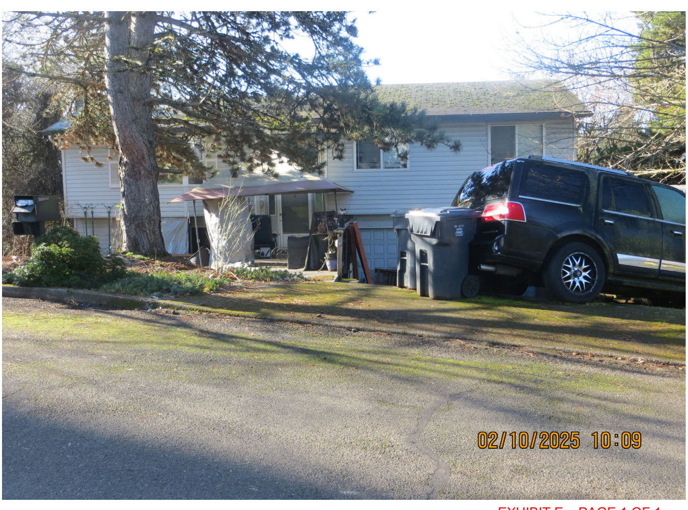
EXHIBIT E _ PAGE 1 OF 1