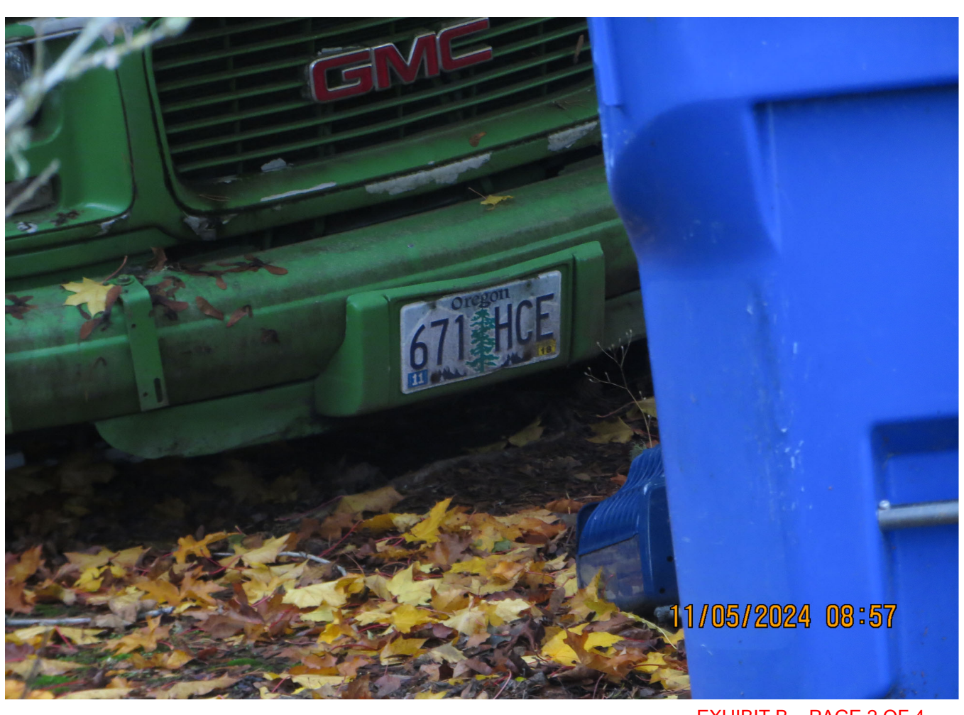
EXHIBIT B _ PAGE 2 OF 4