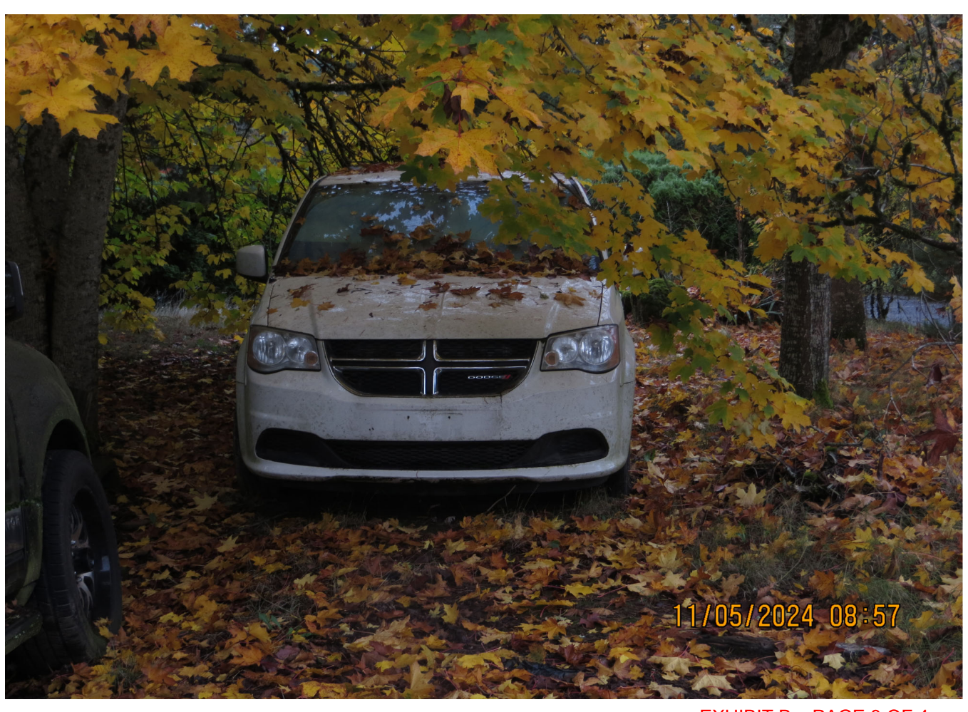
EXHIBIT B _ PAGE 3 OF 4