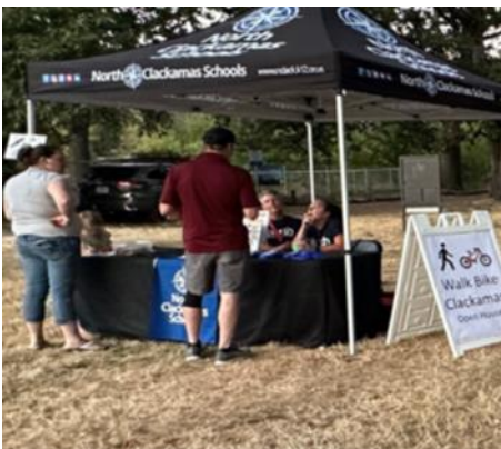
Tabling at North Clackamas Park

The project team hosted multiple public events to engage with the local community and hear about their desire for Clackamas County's future. These activities included community conversations, online surveys (in English and Spanish), an interactive map-based survey, a virtual open house, pop-up events and tabling in the community, including at a Movies in the Park event near Milwaukie and at the Clackamas County Fair in Canby.