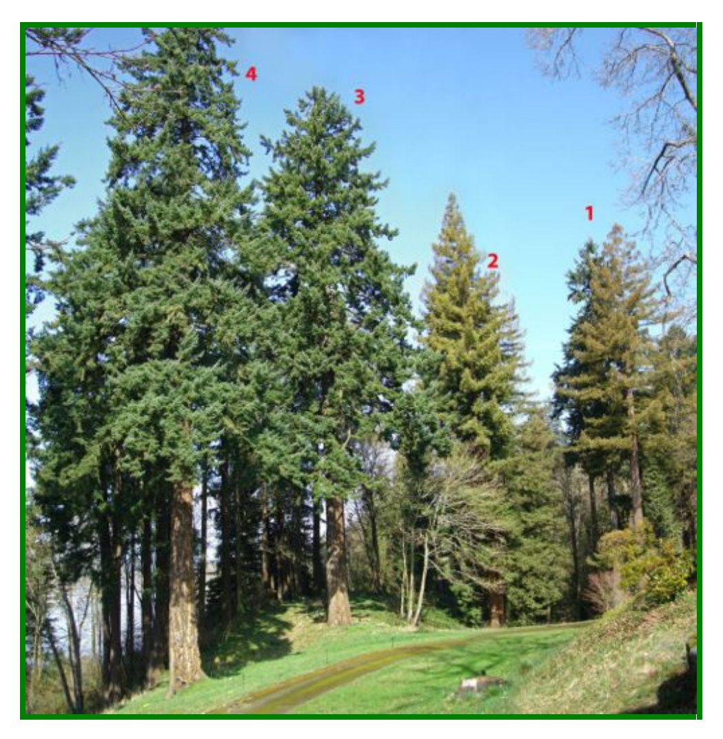
1\ & 2\ Coast redwood, 3\ & 4\ Douglas fir